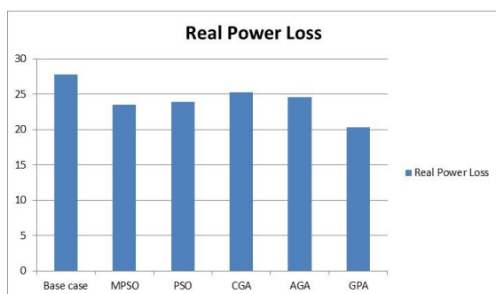
Figure 1. Comparison of real power loss