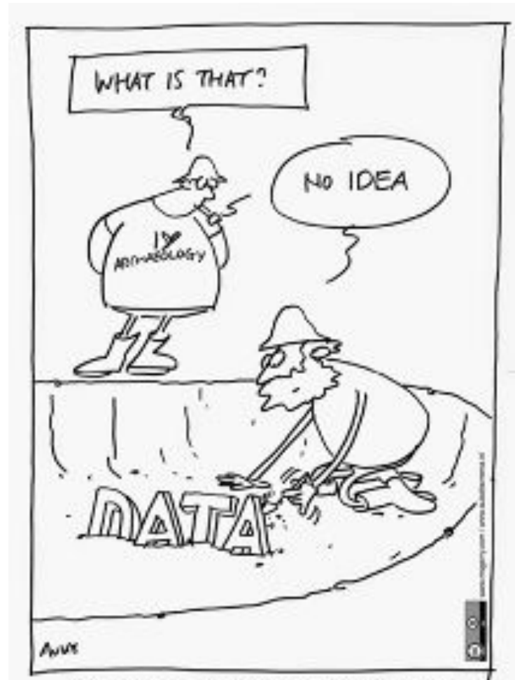
DATA FOR FUTURE GENERATIONS