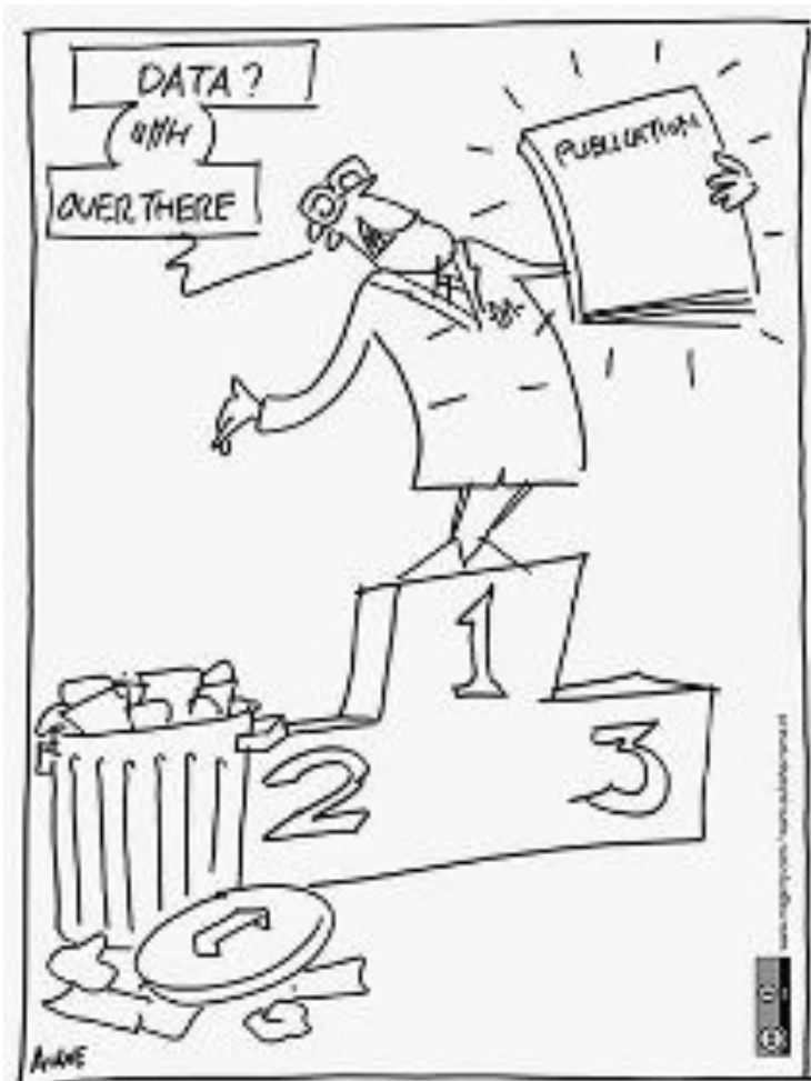
PUBLICATIONS AND DATA