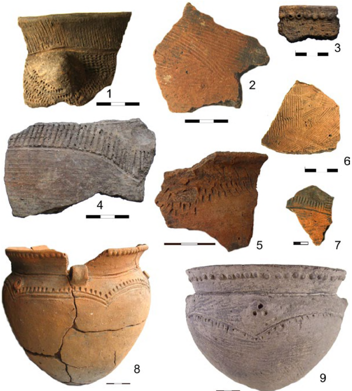
Fig. 2. Trypillia BI-II stage pottery from Dnipro region: 1-5, 7-9 – “Kitchenware”; 6 – fragment with curved decoration, the reverse side (1-8- Kolomyitziv Yar, M. Videiko; 9 – “Culture A”, V. Khvoika).