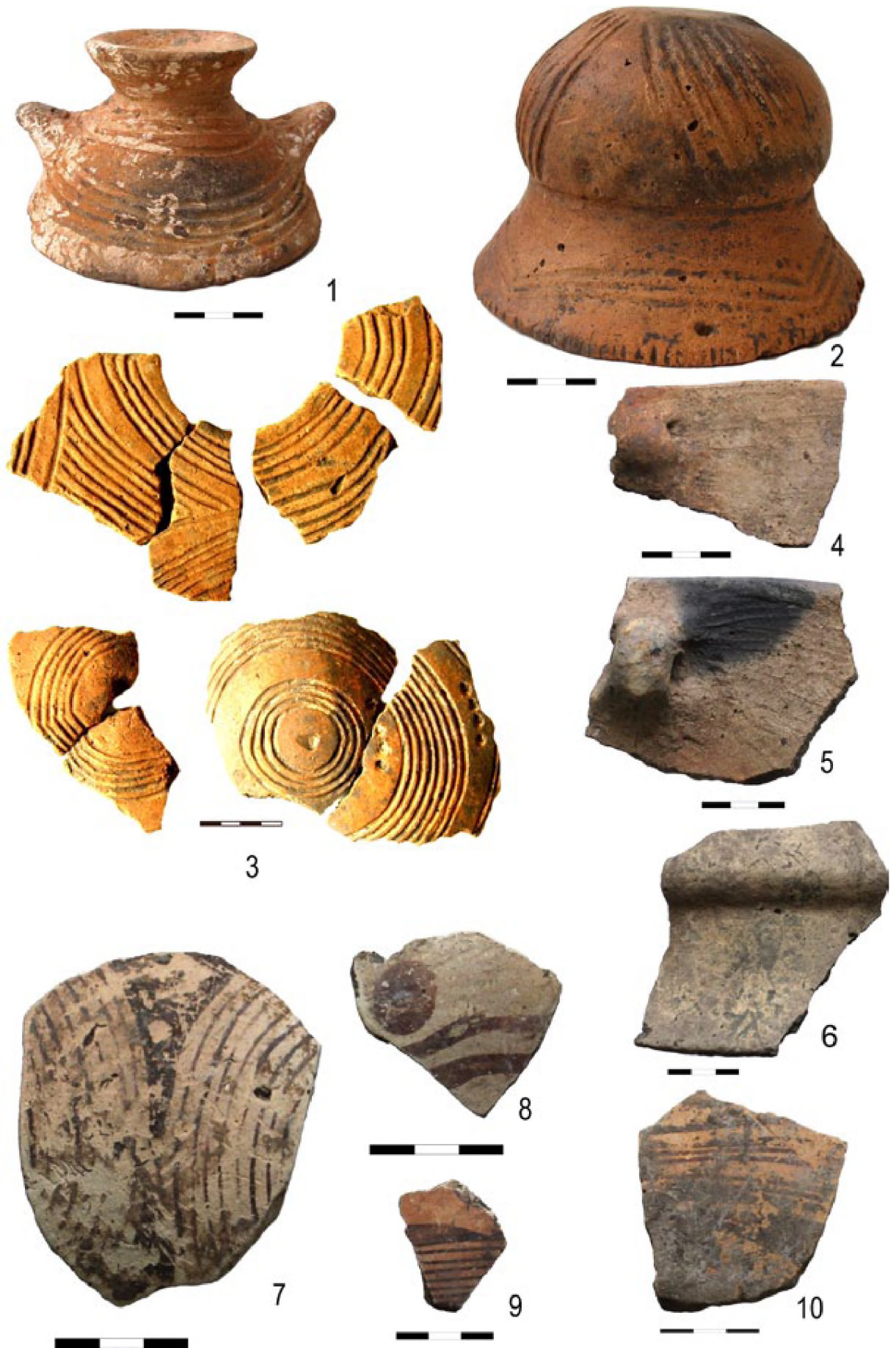
Fig. 1. Trypillia BI-II stage pottery from Dnipro region: 1-3 – carved decoration; 4-6 – without decoration; 7-10 – painted (1-10 - Kolomyitziv Yar).