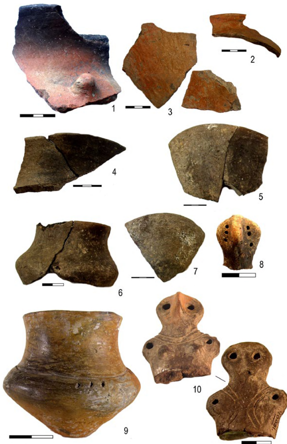
Fig. 5. Trypillia CI stage pottery and figurines from Dnipro region: 1-7, 9 – without decoration; 8, 10 – fragmented figurines. (1,8 – Rypnytsia-VI, M. Videiko; 1 – Khomyne, M. Videiko; 9,10 – “Culture B”, V. Khvoika, National Museum of History of Ukraine).