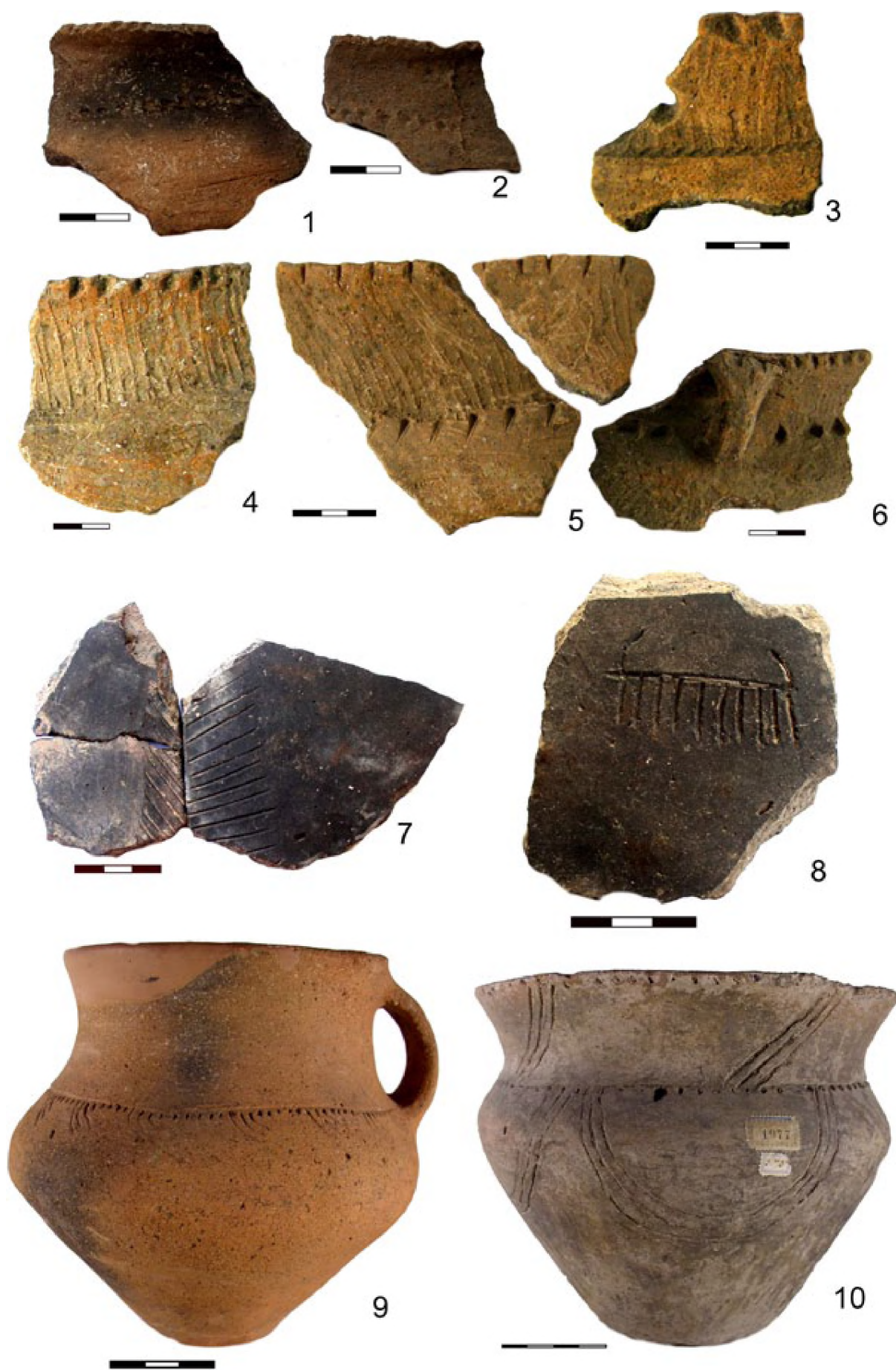
Fig. 4. Trypillia Cl stage pottery from Dnipro region: 1-6 – ‘kitchenware’; 7-10 – with curved decoration. (1-7 – Yan-cha-II, M. Videiko; 7-8 – Rypnytsia-VI, M. Videiko; 9-10 – ‘Culture B’, V. Khvoika, National Museum of History of Ukraine).