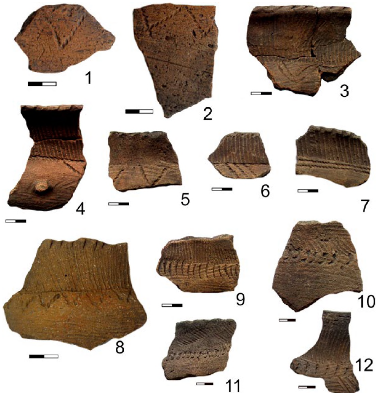
Fig. 7. "Kitchenware" from Dnipro region: 1-8 – with cord decoration; 9-12 – decorated in local Neolithic style, mixed with Trypillia features (1-7, 9 – BII stage; 8, 10-12 – CI stage). (1-2 – Grebeni, Bibikov at alii, 1960-64; 3-7 – Chapaivka, V. Krutz; 8 – Khomyne, M. Videiko; 9-12 – Kazarovichi, V. Krutz.