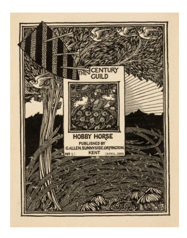
Figure 1: The Century Guild Hobby Horse, 1884. William Morris Gallery, London Borough of Waltham Forest. Image in the public domain.

painting and sculpture" (Meggs 1998). The guild developed projects imbued with the characteristics of Renaissance and Japanese design and represented a significant moment in the Arts and Crafts movement by influencing the floral stylization of Art Nouveau. In addition, all these ideas needed a medium of diffusion; however, in the absence of this means, the best approach was the creation of a space that would allow freedom for new ideas. Thus, The Century Guild Hobby Horse was born (Fig.1); the first magazine of refined impressions exclusively dedicated to the visual arts was published in 1884. The Hobby Horse was the first periodical in the 1880s to present the point of view of the English Arts and Crafts movement to the European public and to treat printing as a serious form of design. According to Meggs (1998), in an article entitled "On the Unity of Art" in the January 1887 edition of the Hobby Horse , Selwyn Image vehemently stated that all forms of visual expression deserved the status of art. He rebuked the Royal Academy of Arts for its very limited scope in representing art and design forms and recommended changing the name of the entity to the Royal Academy of Oil Painting for this reason.