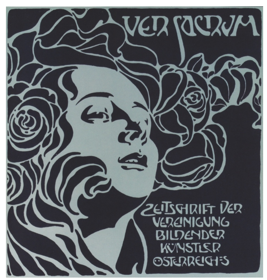
Figure 4: Koloman Moser, Ver Sacrum cover, 2/4, 1899. Image in the public domain.

In general, the possibilities of communicative mechanisms as factors of change in society do not come from technology itself, but rather from what humans do with it. There is no other way to relate except by communicating — a process achieved by humans through technology and media. In this sense, the arts, intrinsic to their techniques, can be considered precursors in the process of evolution and the access to knowledge in Western societies, idealizing and forming the spirit of the time.