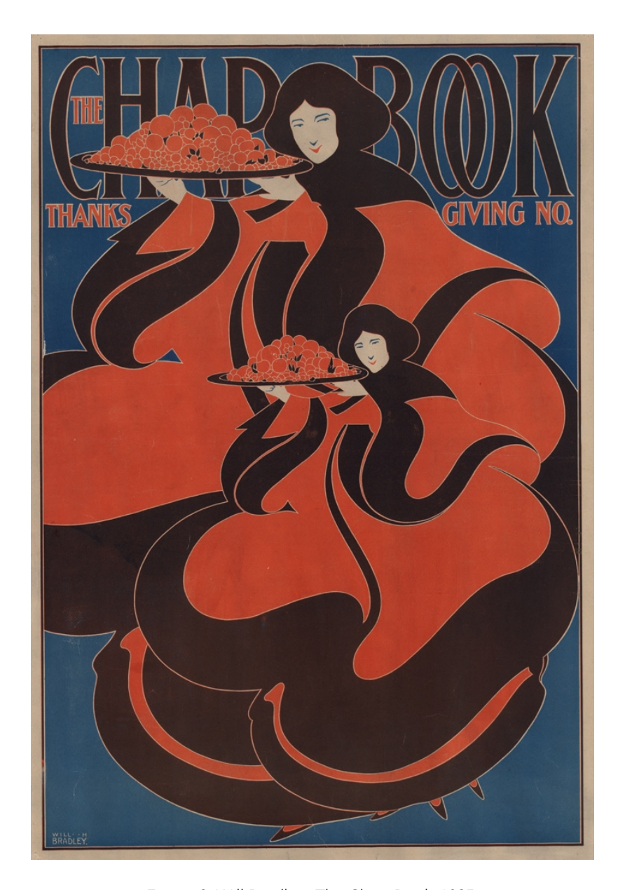
Figure 2: Will Bradley, The Chap-Book , 1895. This image is available from the United States Library of Congress Prints and Photographs Division. Washington, D.C., USA. Image in the public domain.