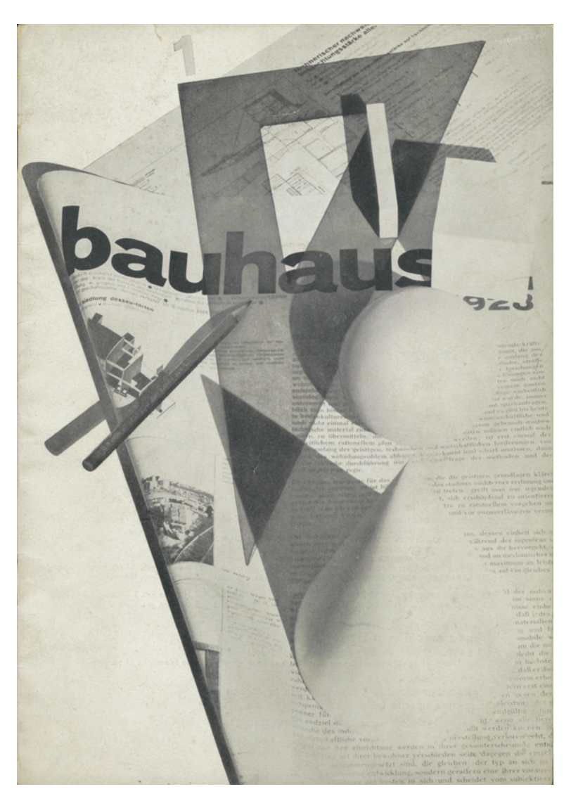
Figure 6: Bauhaus Magazine ( Bauhaus: Zeitschrift für Bau und Gestaltung 2:1)<sup>7</sup> 15 Feb 1928. Editors: Walter Gropius and László Moholy-Nagy. Image Cover by Moholy-Nagy. Image in the public domain.

forms of art and their techniques were essential for cultural transformations that concerned the rupture of values, the constant search for solutions to social problems, and the changing of habits and behaviors. As a result of the Bauhaus lessons, any form of hierarchy that compared both art and design and outlined the differences between the artist and the craftsman would no longer be accepted by its members. Undoubtedly, many innovative results in the world of the arts and between artists were due to the freedoms and equality experienced during the existence of the Bauhaus.