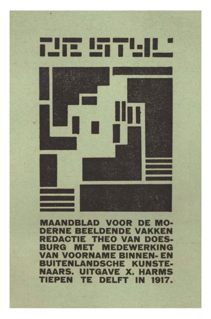
Figure 5: De Stijl, Vol. 1, no. 1, Delft, October 1917. Design by Vilmos Huszár. Image in the public domain.

De Stijl artists. For example, between Van der Leck and Van Doesburg, who gradually began to form their styles with neutral colors — black, gray, and white — not only in painting but also in architecture, sculpture, and typography. It was precisely with this latter technique that Doesburg began his graphic and editorial project by publishing and financing the De Stijl magazine from 1917 until his death in 1931 and disseminating the movement's theory and philosophy to a wider audience (Fig. 5).