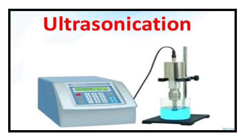
Fig 3:- Ultrasonication.

In this technique premixed emulsion is exposed to agitation at ultrasonic frequency of 20 kHz reducing the droplets to nanodroplets size. The resultant emulsion is then passed through high shear region to form droplets with uniform size distribution ^{[16]} Water jacket is employed in this technique to regulate the temperature. Sonotrodes also known as sonicator probe consisted of piezoelectric quartz crystals as the energy providers during ultrasonic emulsification. On application of alternating electric voltage, these sonotrodes contract and expand. Ultrasonication method is described in figure 3 Mechanical vibrations are produced when the sonicator tip contacted the liquid resulting in cavitation, which leads to collapse of vapour cavities formed within the liquid. This technique is mainly adopted when droplet size less than 0.2~\mu is required. Shi et al. formulated emodin-loaded nanoemulsion by using ultrasonic emulsification method at a frequency of 25 kHz and achieved mean diameter of emodinloaded nanoemulsion was found to be in the range of 10-30 nm ^{[17]}