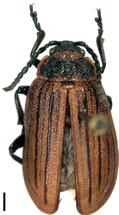
Figure 9. Galeruca jucunda . Scale line = 1 mm.

Hypera (Hypera) postica (Gyllenhal, 1813). Material examined: № 10 (2 specimens, NMNHS). Distribution: whole Europe (including Caucasus and Transcaucasia), North Africa, Turkey to Xinjiang; accidentally introduced to Japan and North America.