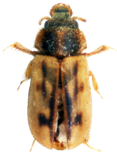
Figure 7. Augyles turanicus , a typical shore beetle. Scale line = 1 mm.

Augyles turanicus (Reitter, 1887). Material examined: № 19 (1 ♀, NMNHS; Fig. 7). Distribution: Algeria, Georgia, Levant (Turkey, Syria, Israel), Middle East