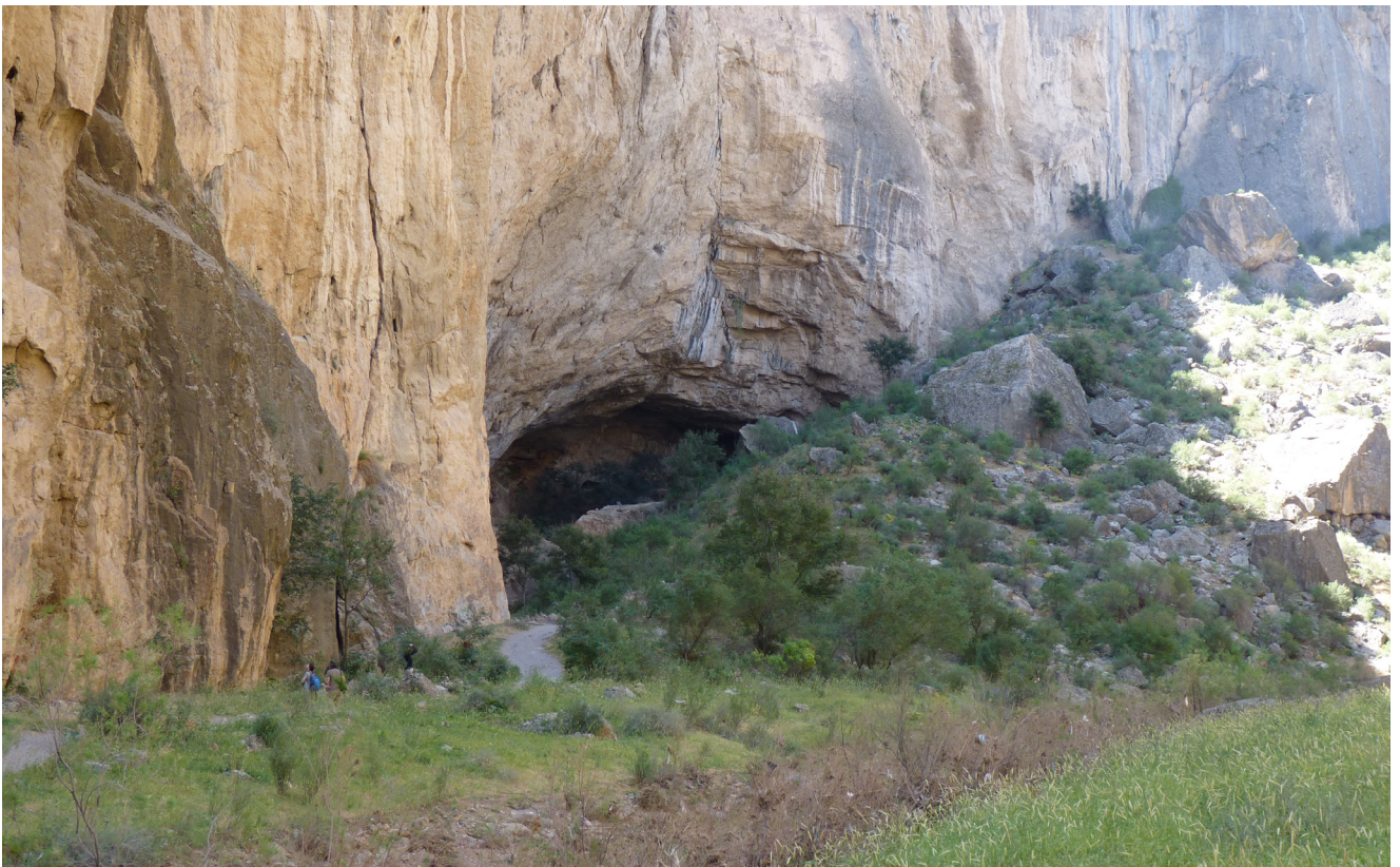
Figures 1–2 (photos courtesy of Pavel Stoev). Locality № 07: the passage Gyrkgyz dere, a collecting site for Chlaenius ex-tensus , Quedius novus , Q. scintillans and Cyphogenia aurita aurita .