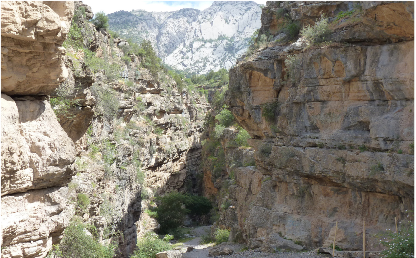
Figure 3. Locality № 10: the canyon Umbar dere, a collecting site for three species first reported from Turkmenistan: Chlaenius extensus , Quedius novus , and Galeruca jucunda .