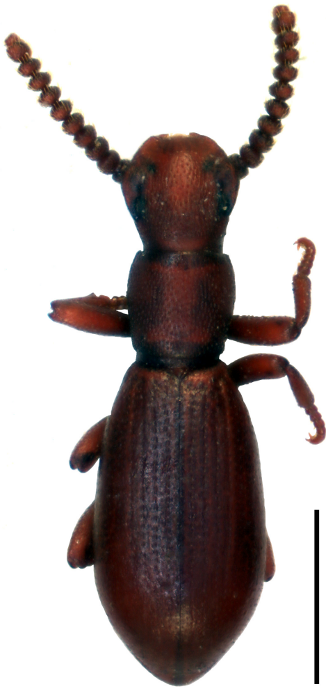
Figure 8. Dichillus seminitidus , a typical nocturnal beetle. Scale line = 1 mm.