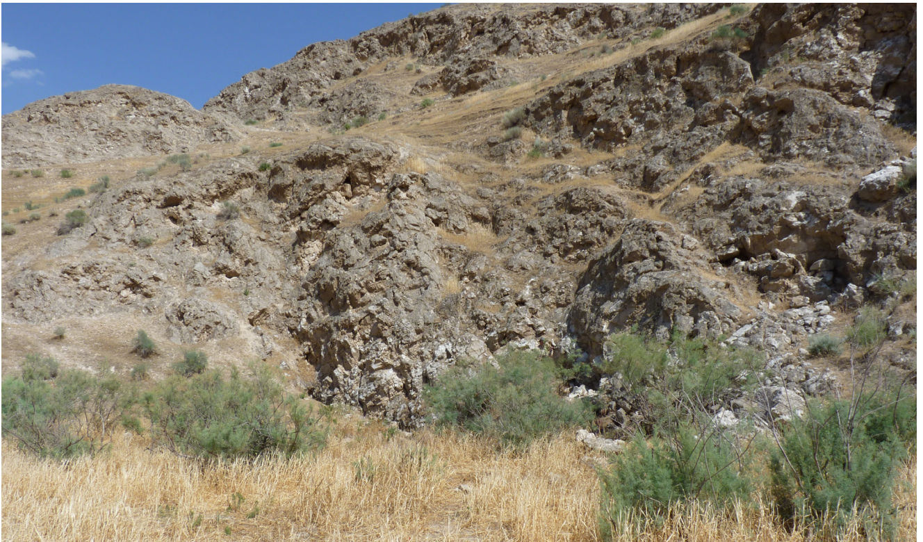
Figures 4–5. Localities № 5, № 15 and № 19: grasslands surrounding the Kōýtendag Nature Reserve Headquarter, a collecting site for some widely distributed species, such as Apotomus rufithorax , Syntomus fuscomaculatus , Hybosorus illigeri , Augyles turanicus , Cheirodes brevicollis , Gonocephalum rusticum , G. setulosum setulosum , Chaetocnema hortensis , and Sharpia rubida .