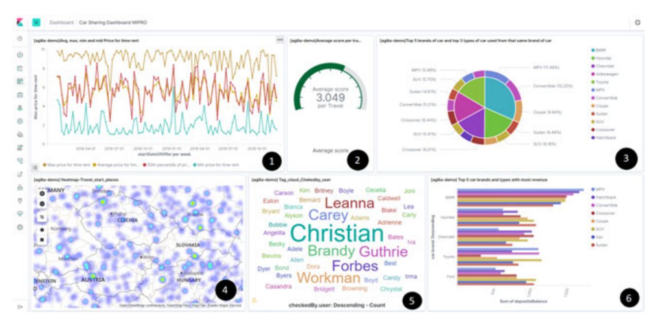
Fig. 2. TAC dashboard car-sharing implementation

model with context knowledge and context-sensitive interpretation that will improve collaboration amongst intelligently defined car-sharing communities.