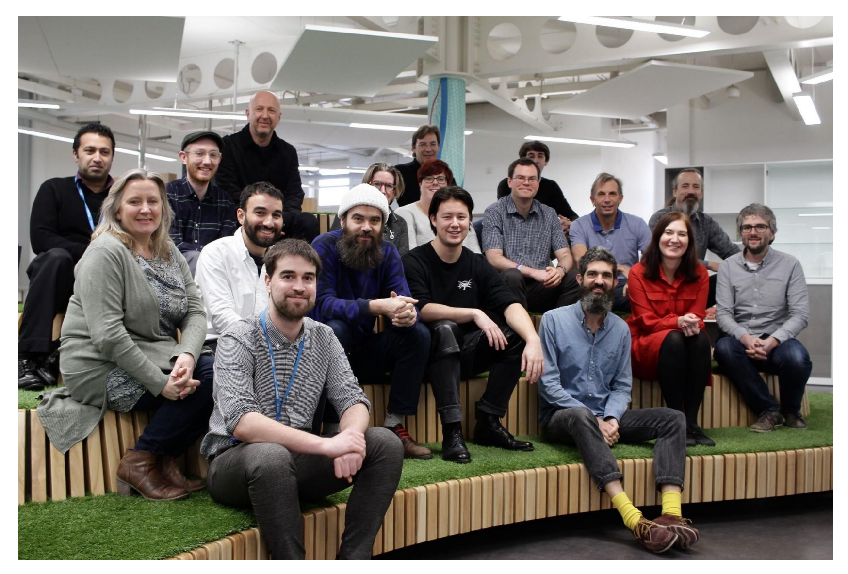
Figure 1: Project Kick-Off @ Coventry University, Jan 10, 2020. Image credit: Paul Henderson, 2020. CC BY 4.0.

Community-led Open Publishing Infrastructures for Monographs (COPIM): Year 1