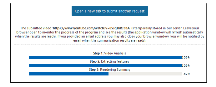
Figure 2: The summarization progress bars of the frontend.