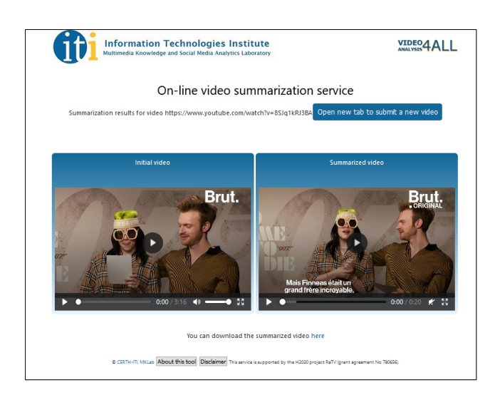
Figure 3: The results page of the frontend.

result is ready. The results page is an interactive webpage with two video players (for viewing the original and summarized videos) implemented using the HTML5 video tag. The players support all standard functionalities such as play/pause the video and toggle the video in full screen mode. Furthermore, the user is able to download the produced summary. The developed Web service for video summarization is fully compatible with Mozilla Firefox (>41.0), Chrome (>45.0), Opera (>32.0), Microsoft Edge (>77.0.200.1), and IE (>11.0).