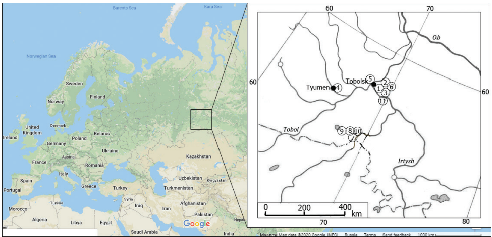
Figure 1. The locations of the species cited in the article. The numbers in circles denote the locations of the following species: 1 – Potamogeton × acutus , Potamogeton tenuifolius , Utricularia ochroleuca ; 2 – Potamogeton lacunatus ; 3 – Potamogeton lacunatus , Utricularia australis ; 4 – Potamogeton × pseudolacunatus ; 5 – Stellaria fennica , Utricularia australis ; 6 – Cypripedium macranthos ; 7 – Pedicularis dasystachys , Ranunculus silvisteppaceus ; 8 – Stuckenia chakassiensis × S. macrocarpa , Elodea canadensis , Zannichellia repens ; 9 – Impatiens glandulifera , Phragmites altissimus ; 10 – Phragmites altissimus ; 11 – Galega orientalis .

Material examined. RUSSIA, Tyumen Reg. – Tyumen. • next to the intersection of street of “50 years of the VLKSM” and passage “Geologorazvedchikov”; 57.1305°N, 65.5715°E; Pond ‘Utinyi’ (the pond between school No 6 and railway); 12 Jul. 1994; I.V. Kuzmin leg. (Fig. 1).