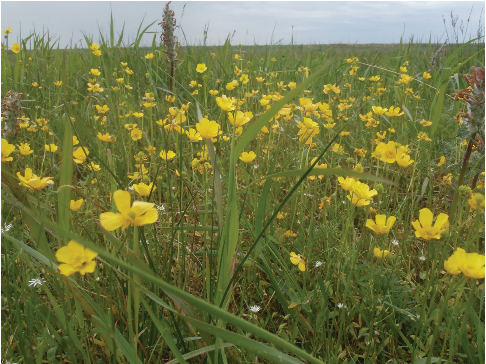
Figure 5. Ranunculus silvestepaceus Dubovik from cited location.

Material examined. RUSSIA, Tyumen Reg. – Armizonsky distr. • 4.3 km NE of Poloe; 55.7618°N, 67.8373°E; west shore of the Lake “Bol'shoe Beloe”, brackish meadow; 30 Jul. 2019.