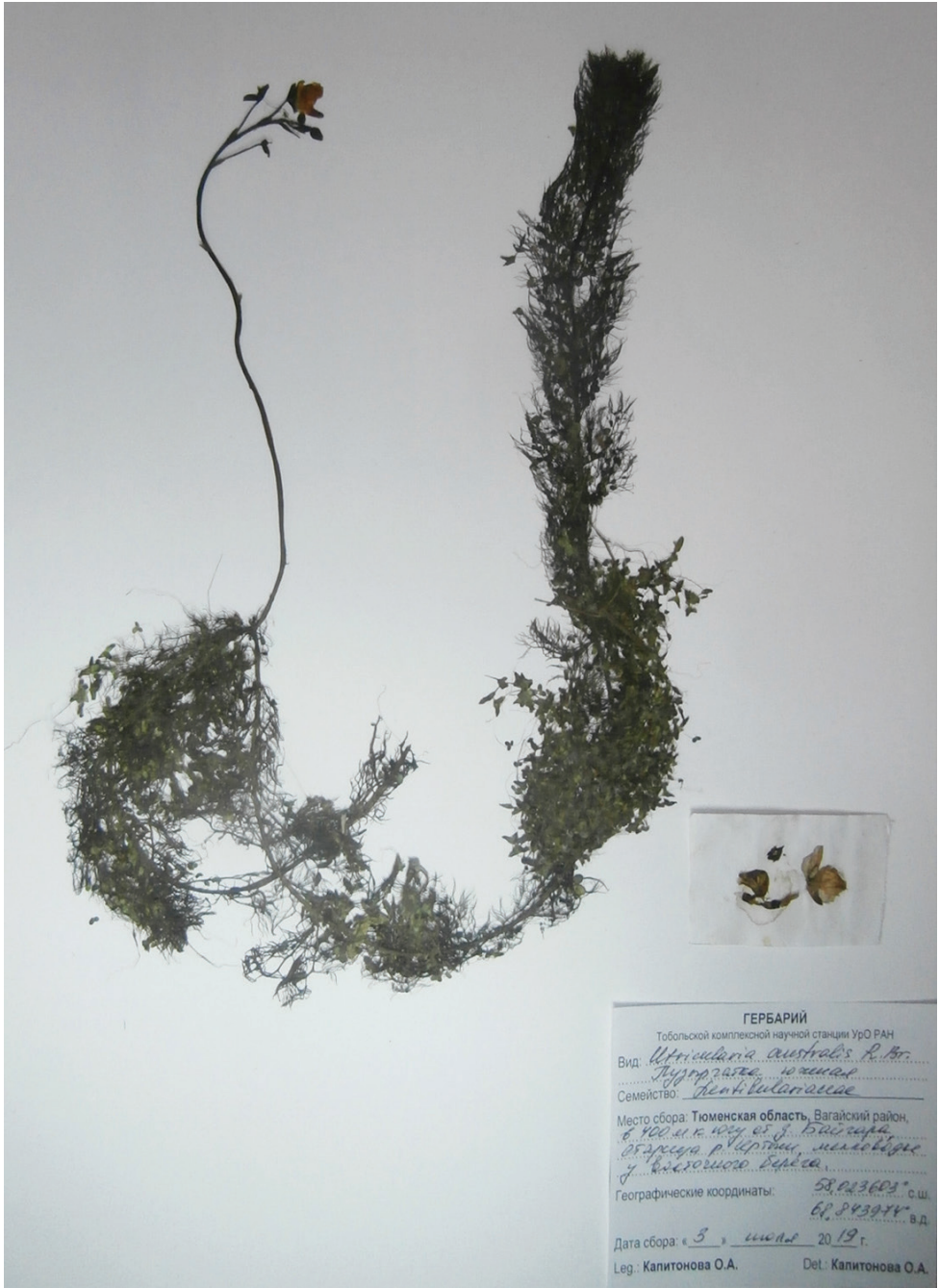
Figure 3. Utricularia australis R. Br. Tobolsk distr., 400 m S of village Bajgara, lake in the floodplain of the Irtysh River, 3 Jul. 2019.