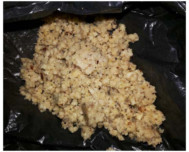
Figure 2. Brazil nut Bertholletia excelsa grounded, used in the study.

The experimental diet was prepared in LAPA; the dry ingredients were weighed and homogenized to 1 mm (Figure 2). For drying, the ration was placed in an oven with forced air circulation for 48 hours (55 °C), and then it was packed in plastic pots and conditioned in a refrigerator at a temperature of 4 °C. The treatments were T0, T3, T6, T9 and T12 with inclusion of 0 %, 3 %, 6 %, 9 % and 12 % of Brazil nut respectively. Brazil nut used can be seen in Figure 2.