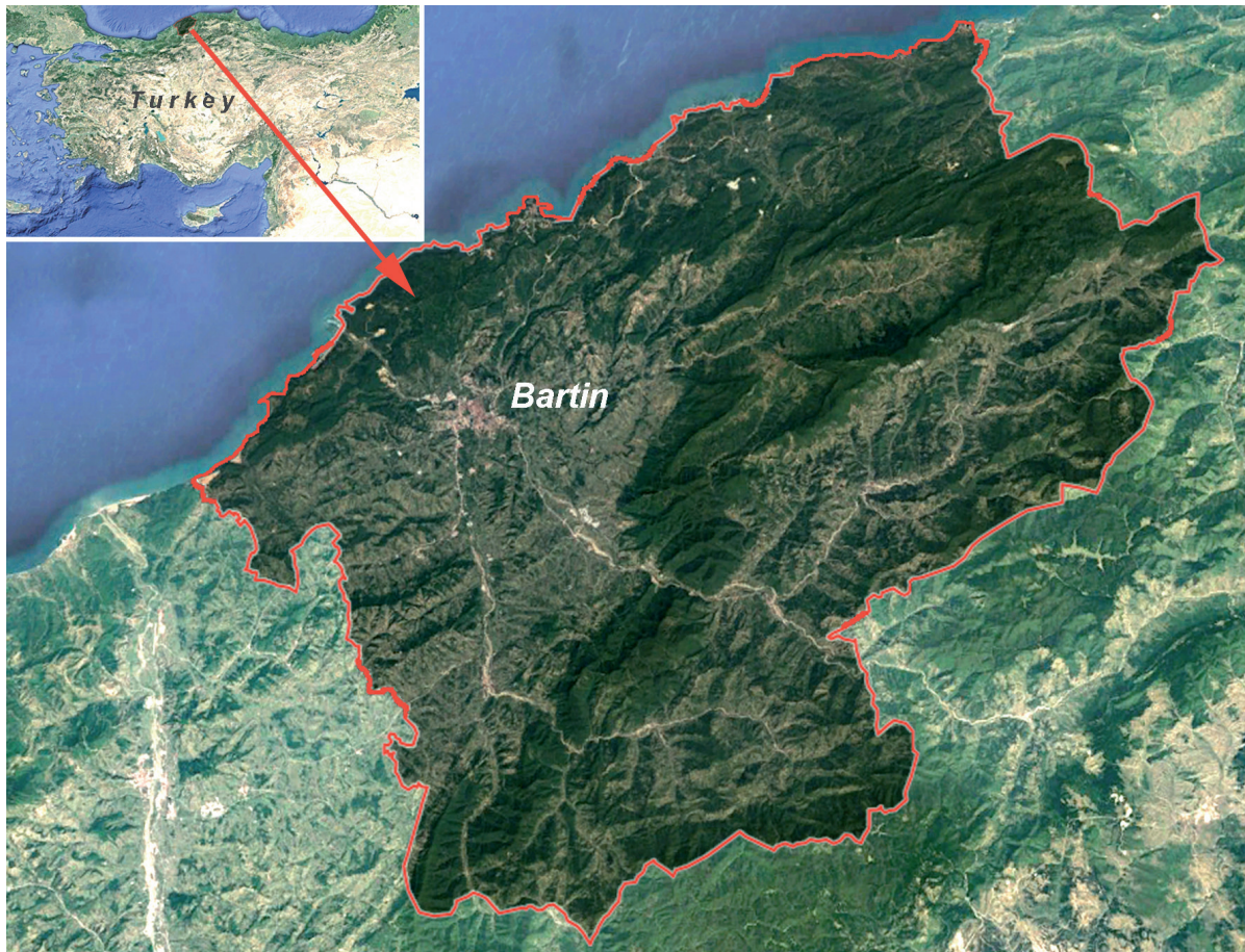
Fig. 1. The map of Bartın province located on the Western Black Sea region of Turkey.

The taxa were identified on the basis of Flora of Turkey and the East Aegean Islands (Davis (ed.), 1965-1982). The nomenclature was harmonized