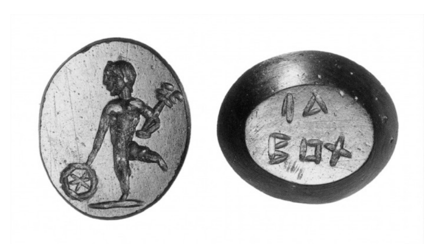
Fig. 10. Green jasper (12 x 10 x 3 mm). London, British Museum G 1986,5–1,126.