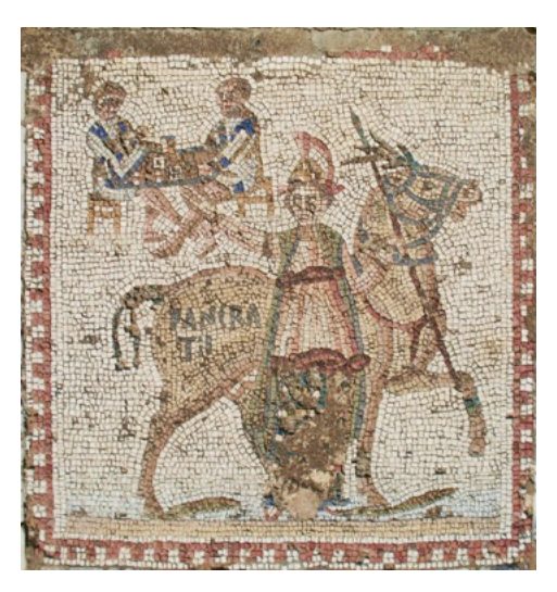
Fig. 7. Panel of the Horses mosaic (60 x 60 cm). Carthage, Antiquarium. After C. Lambrugo, F. Slavazzi, and A. M. Fedeli (eds.). 2015. I materiali della Collezione Archeologica "Giulio Sambon" di Milano 1. Tra alea e agòn giochi di abilità e di azzardo . Firenze: All'insegna Del Giglio, pl. 1a.

object also exists in the extant material record.<sup>26</sup> A well-preserved one, made in bronze, comes from a 4<sup>th</sup> century Roman villa near Froitzheim in Germany with an inscription celebrating the victory of the Romans over the Picts: "The Picts defeated, the enemy wiped out; play without fear" (fig. 6; 370–80 CE).<sup>27</sup>