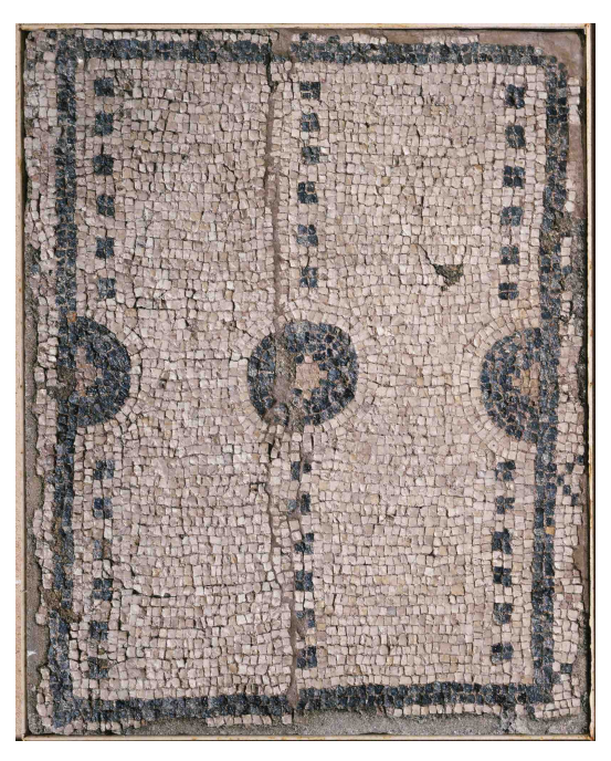
Fig. 8. Mosaic board, Alea (96 x 122 cm). Princeton University Art Museum. Gift of the Committee for the Excavation of Antioch (y1965–616).

Two variants are known. One was played with two dice ( Ludus duodecim scripta ), the other with three dice ( Alea ).<sup>30</sup> In both variants counters are lined during the course of the play, as depicted on the Seyrig gem.