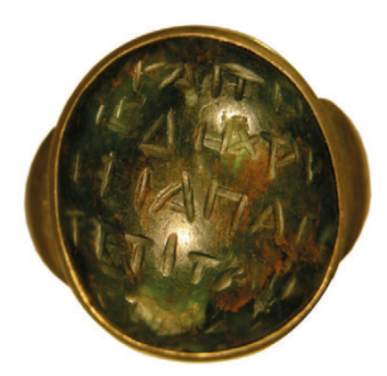
Fig. 13. Chalcedony (18 x 16 x 6 mm). Paris, Département des Monnaies, médailles et antiques de la Bibliothèque nationale de France 618, Froehner coll.

The meaning and function of the Seyrig gem may thus relate to the wish of the owner to safeguard the life course compared with the course of the play, between life (Khnum) and death (Anubis). A similar notion occurs on other "magical gems". A green chalcedony in the Cabinet des Médailles in Paris (fig. 13; ca 2<sup>nd</sup> cent. CE)<sup>57</sup> is carved with an inscription adapting a Homeric verse: A | KAITO | ΤΕΔΗΧΡΥ | CEIAΠATH | PETITAIN | ETAΛA | NTA.<sup>58</sup> The text refers to the weighing of the fates of Achilles and Hector: "[...] The Father [Zeus] lifted on high his golden scales, and set therein two fates of grievous death, one for Achilles, and one for horse-taming Hector; then he grasped the balance by the midst and raised it; and down sank the day of doom of Hector, and departed unto Hades."59 The up and down motion of the scale refers to the same idea as the play. Philo of Alexandria (1st cent. BCE/CE) uses a ludic metaphor for expressing the uncertainty of fate in war and politics: "So much do human affairs twist and change, go backward and forward as on a board game."60 This vision of the board game as an allegory for the course of life continues in Late Antiquity. Isidore of Seville (560–636 CE) reports that players could regard the distribution of six fields in three rows as the six ages of life associated with past, present, and future: