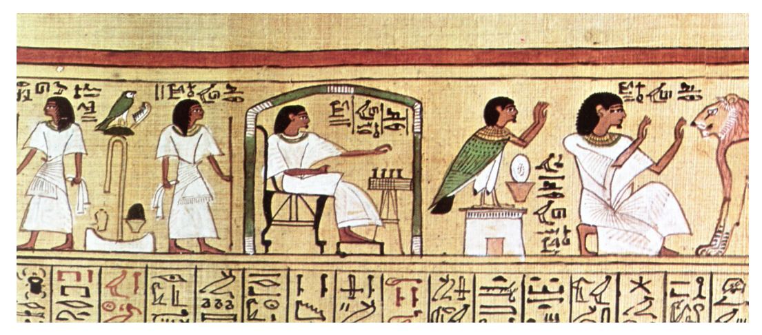
Fig. 3. Papyrus of Hunefer. London, British Museum EA9901,8. After Rossiter, E. 1979. Le Livre des morts, Papyrus d'Ani, Hunefer, Anhaï . Fribourg, Genève: Liber, Minerva, fig. on 85.

He or she is sitting in a pavilion before a table facing an invisible player, as on the Papyrus of Hunefer (fig. 3; Dynasty 19, ca 1280–1270 BCE).<sup>18</sup>