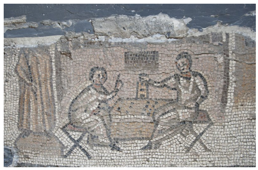
Fig. 9 a-b. Megalopsychia mosaic, topographical border. Antioch, Hatay Archaeological Museum, Antakya 1016.