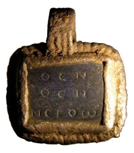
Fig. 1a-b. Lapis lazuli in a silver setting (19,7 x 18 x 4 mm, including the setting). Paris, Département des Monnaies, médailles et antiques de la Bibliothèque nationale de France, Collection Seyrig, AA.Seyrig.81.

On one side (fig. 1a), two male figures are sitting on folding chairs, face to face, playing together on a board put on their knees. The man on the left is jackal-headed, naked, with a chlamys on his left shoulder; he raises his right hand, the left one resting on the left upper corner of the board. On the right, a naked, muscular, ram-headed