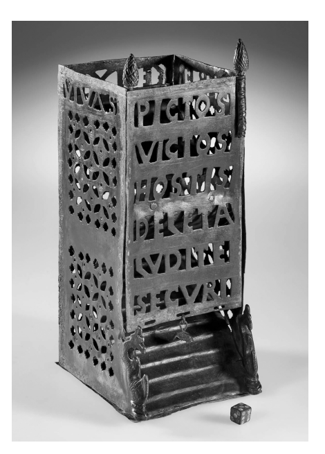
Fig. 6. Bronze dice tower (H. 22.5 x 9.5 x 9.5 cm), from a Roman villa, Wettweiss Froitzheim. Bonn, Rheinisches Landesmuseum 85.0269.

if indicating a number. Two onlookers surround them and seem to comment the course of the play. The animation of the scene alludes to the public dimension of the performance. The 4<sup>th</sup> century scholion of the Praise of Piso thus tells us that a crowd gathered when C. Calpurnius Piso displayed his strategic skills.<sup>24</sup> The anecdote may not relate to the historical Piso, but it is based on the observation of daily life scenes. A similar show may be recalled in the miniature stone.