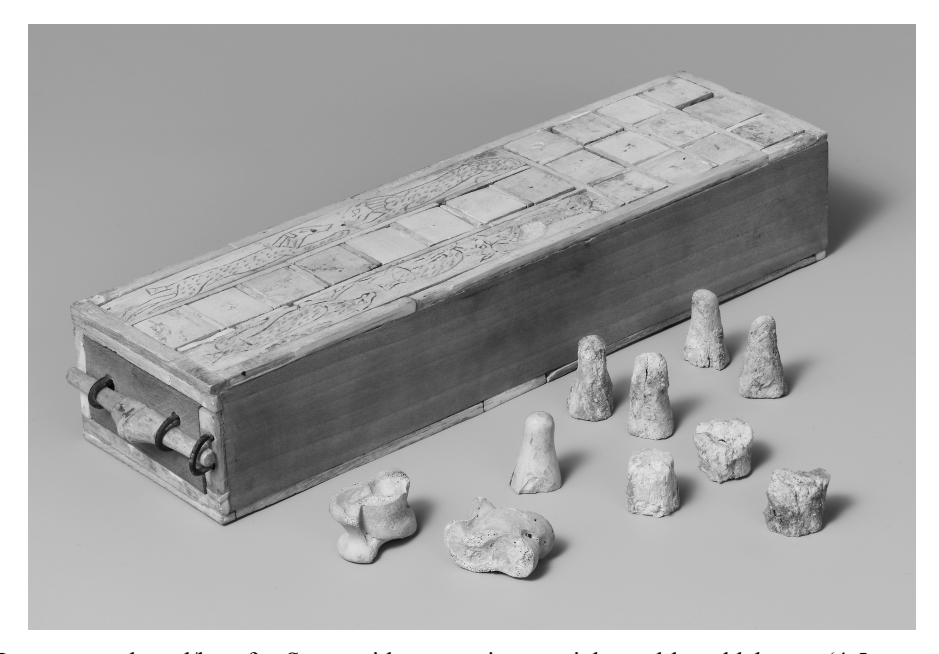
Fig. 2. Ivory game-board/box for Senet with game pieces, sticks and knucklebones (4.5 cm x 28 cm). The twenty squares game is on the underside of the box. London, British Museum EA66669.

off the board. The progression along the path is determined by the throw of four sticks or knucklebones. Beside slab-like and graffito-boards, the standard type of board is a rectangular box during the New Kingdom (fig. 2; 1400 BCE–1200 BCE).