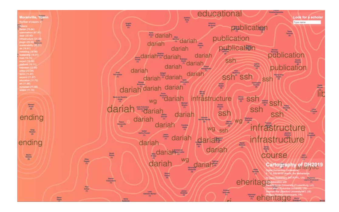
Figure 2: This image illustrates a specific area of the map in which the term 'dariah' is recurrent. The term reassembles the people working within the Dariah community. By zooming, the terms change according to the scale; the more the reader zooms in, the more generic the terms are.