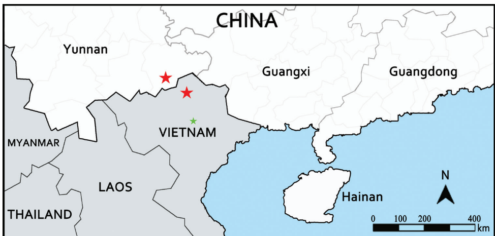
Figure 1. Distribution records of Protomarattia tonkinensis Hayata noted by Hayata (1919, green star) and new records in China and Vietnam (red stars).

Protomarattia Hayata (1919), a monotypic genus of Marattiaceae endemic to the Vietnam, was described based on Protomarattia tonkinensis . The author pointed out that it differs from its morphologically-similar species, Archangiopteris tamdaoensis Hayata (1919) by elongated linear synangia. Based on the morphological study on the isotype of Protomarattia tonkinensis , Christensen and Tardieu-Blot (1935) suggested that ‘the sori are young, pressed against each other, compressed, but not fused into ‘synangia’’ and treated P. tonkinensis as a synonym of Ar. tamdaoensis . Later, Ching (1958) treated P. tonkinensis and Ar. tamdaoensis as synonyms of Ar. tonkinensis (Hayata) Ching (1958). Based on previous studies and her own morphological study, Camus (1989) merged Protomarattia and Archangiopteris into Angiopteris and transferred Ar. tonkinensis to Angiopteris under the new combination Angiopteris tonkinensis