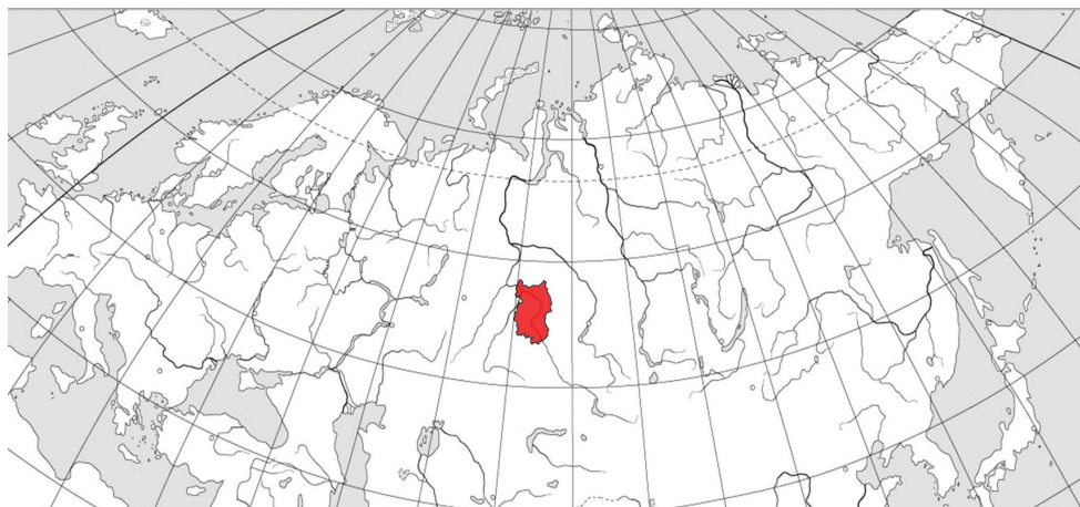
Figure 1. Location of the Omsk Oblast in Northern Eurasia

ria (Zolotarenko 1970; Zolotarenko and Dubatolov 2000; Korshunov 2002; Yakovlev 2004; Vasilenko 2006). During this period, the list of diurnal butterflies was completed (Knyazev 2009), and available data on moths families were initially compiled. During 2005–2019 there was a surge in interest in the study of moths mainly caused by the improvement of the technical and information equipment of regional entomologists. This resulted in several representative reports on most groups of moths (Knyazev et al. 2010a, 2010b, 2010c, 2010d; 2011, 2012, 2013; 2015a, 2015b, 2016, 2017, 2019; Knyazev and Efetov 2014; Knyazev and Mironov 2015; Knyazev 2016).