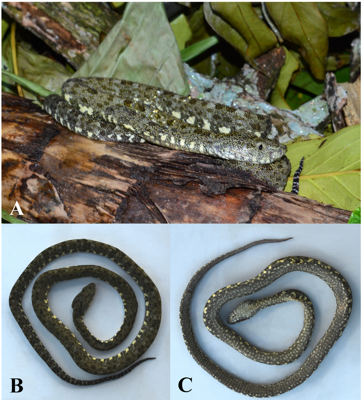
Figure 1. Adult male Bothrops taeniatus (CIRA-800) collected in Bolivia, Department of Pando, Nicolás Suárez Province. A. Full body, live photo. B. Dorsal view. C. Ventral view.

Bolivia was provided by Harvey et al. (2005), including two voucher specimens (LSUMZ-45976 from Pando, Nicolás Suárez, and CBF-2304 from La Paz, Abel Iturralde). Both of these specimens were collected considerable distance (approximately 95 km west and 350 km south, respectively) from the new locality. Most recently, Nogueira et al. (2019) compiled a list of B. taeniatus specimens and distributions that include Bolivia; however, this list is problematic, as several specimens do not have reference voucher numbers and, in addition, the publication includes numerous errors and duplications. One additional voucher specimen deposited