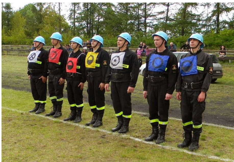
Fot. 1. Volunteer Fire Brigade team – at competitions

the Descartes platform. People from the age of 15 took part in the study.