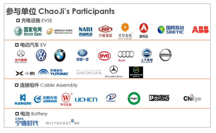
Figure 3: Key ChaoJi participants (CEC side)

prototype EV through this project. This automaker, despite much pressure to electrify its product offering, had not dared to launch an EV until ChaoJi. The engineer in charge of the R&D explained that the company was not convinced by the existing DC charging protocols because their vehicles are typically used for over 20 years by several generations of users quite often in different parts of the world before their end of life, and they wanted a durable solution. ChaoJi was the first to show this company promise for entering the EV market as it was 'a protocol that has sufficiently large market coverage, which shall allow cost reduction and longer expected technology life time, with safety ensured through years of scrutiny by CHAdeMO.<sup>24</sup>'