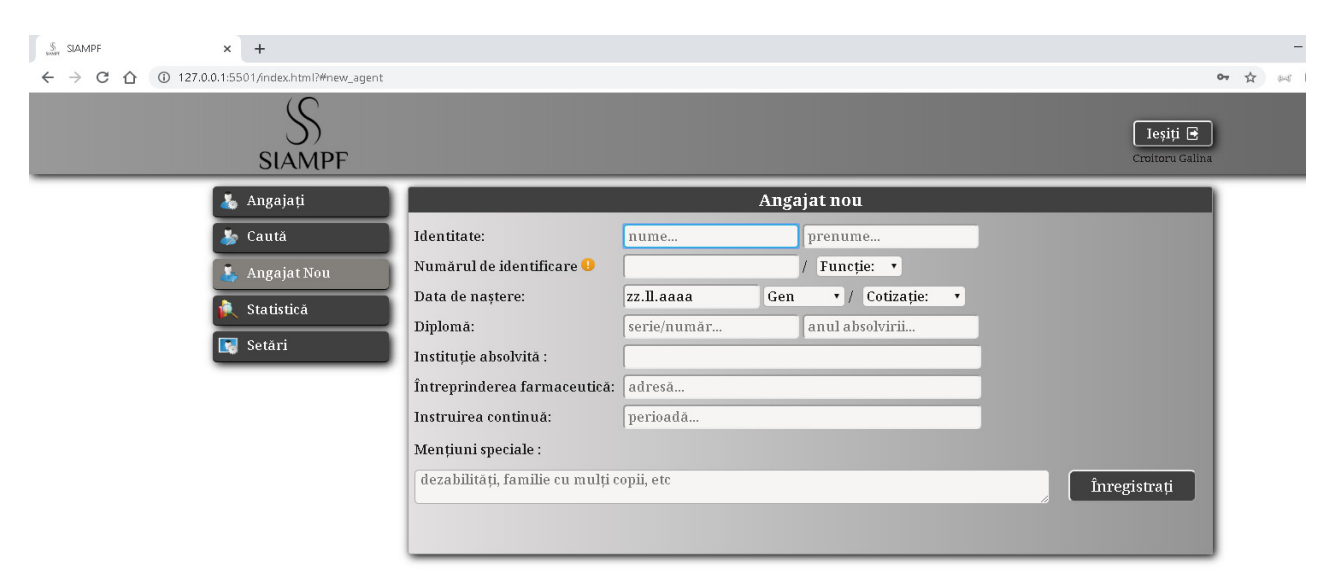
Fig. 1. Graphical interface of the pharmacy user when a new employee is being introduced