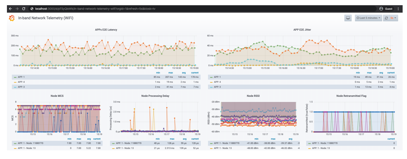
Fig. 2. Interactive GUI screenshot.

the E2E jitter of the flow or the maximum allowed E2E latency of an application is compared against the median value of the last 10 second-measurements. In cases where QoS requirements are not met, slices are reconfigured in such a way that flows belonging to the QoS-restricted applications receive larger portions of airtime than others. Otherwise, resources are gradually released so the Best Effort (BE) flows can utilize the remaining resources. To achieve this, our framework triggers slice airtime MAC reconfigurations towards the RAN via the SD-RAN controller. Therefore, delay-sensitive requirements can be achieved and visualized in our interactive GUI.