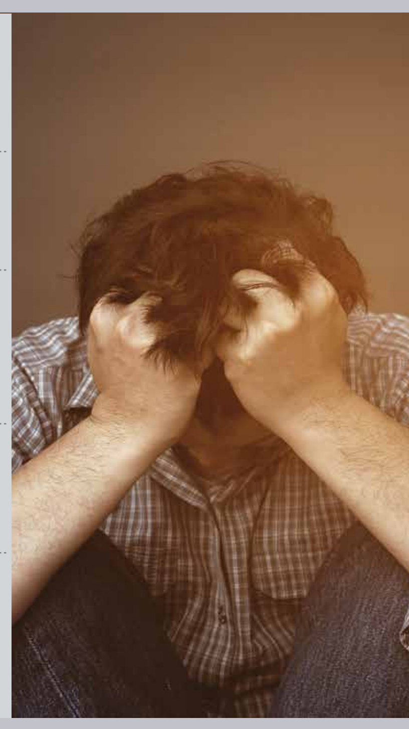
Figure 1: The Prevelence of behaviour Among Adolescents with Depressive Symptoms