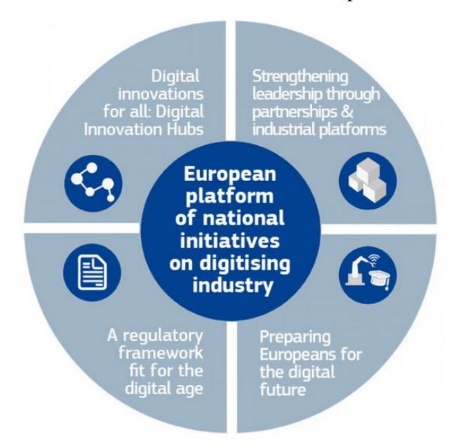
Figure 1: Pillars of the European Initiative "Digitizing European Industry"

The initiative "Digitizing European Industry" targets to meet Europe's needs to join forces under a common strategy that takes digitalization of the EU's economy forward in order to unlock the full potential of the 4th industrial revolution. The pillars of this initiative are: