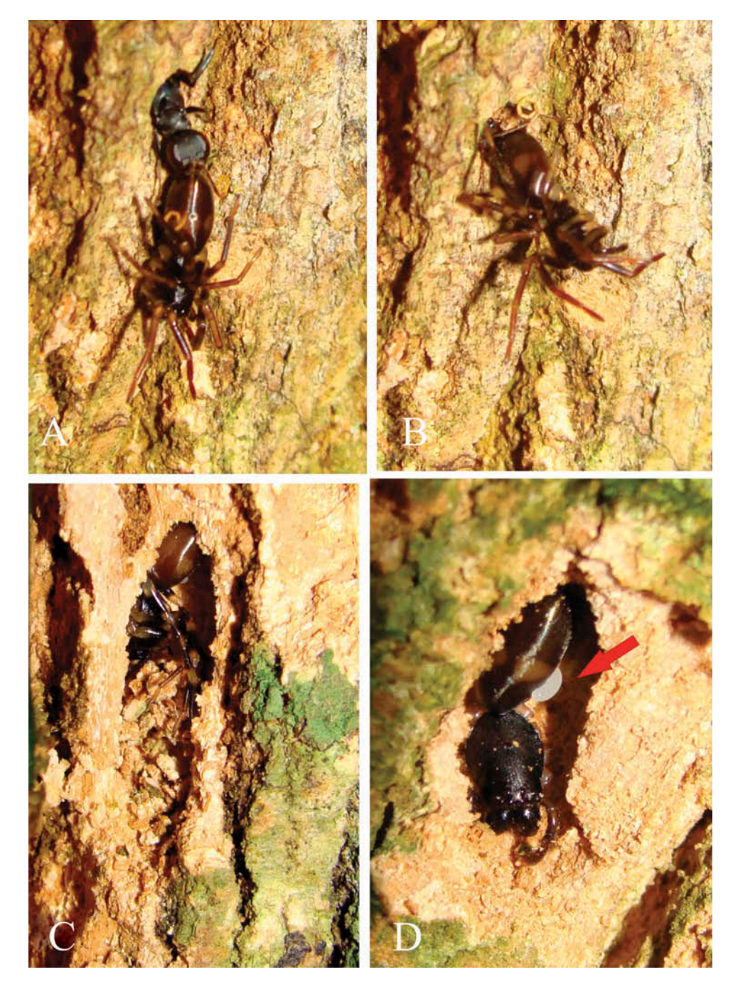
Figure 3. (A, B) Eragenia congrua inside the nest pulling the spider by the spinnerets; (C) opened nest of E. congrua with the host spider in the bottom and entrance closed with pieces of wood; (D) host spider with an egg (indicated by arrow) inside an opened nest of E. congrua .