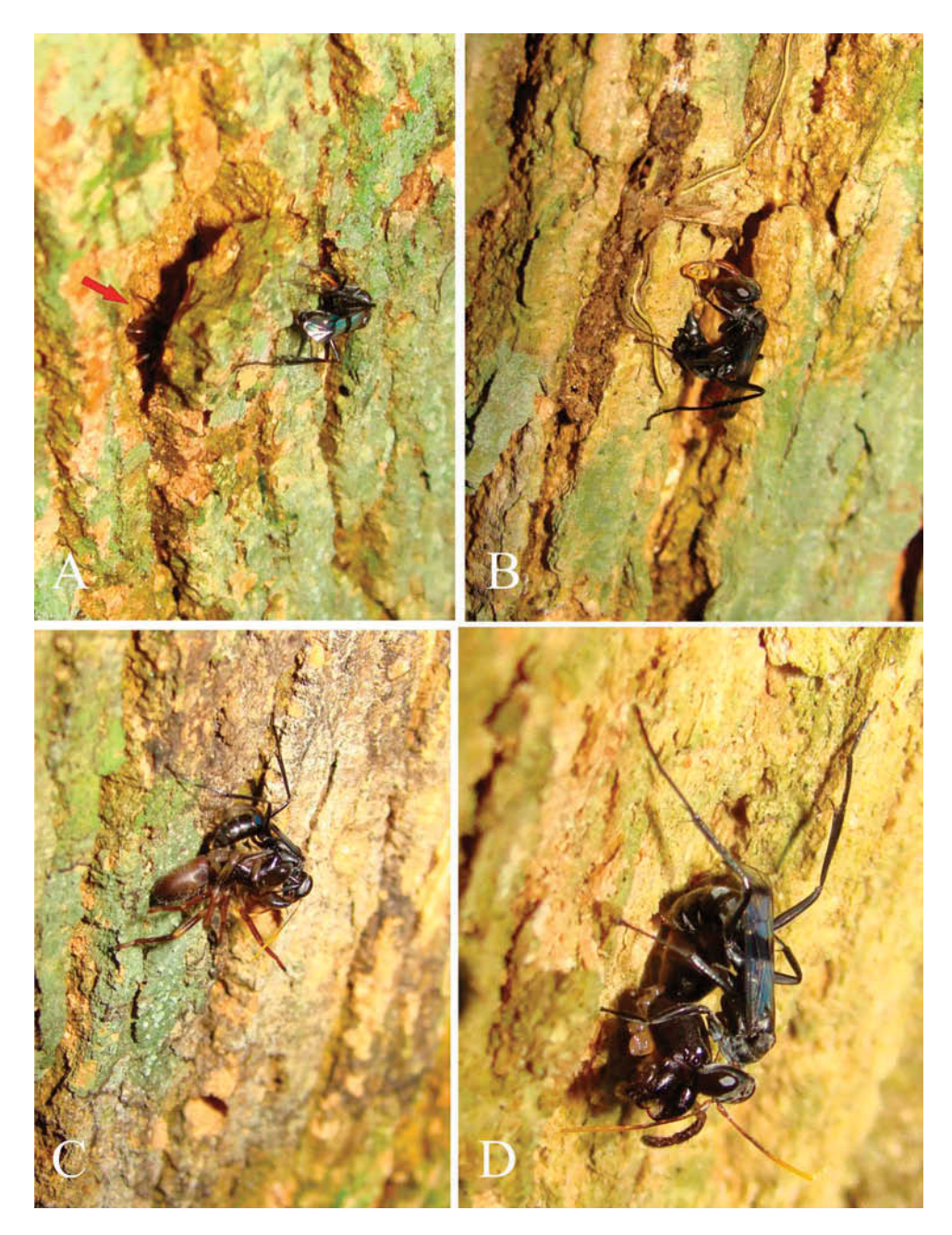
Figure 2. (A) Spider host stored underneath a loose piece of bark (indicated by arrow) and Eragenia congrua searching for the nest entrance; (B) Eragenia congrua filling nest entrance with pieces of wood. (C) Eragenia congrua grooming a spider before storing it in the nest; (D) Eragenia congrua grasping spider by the base of chelicerae.