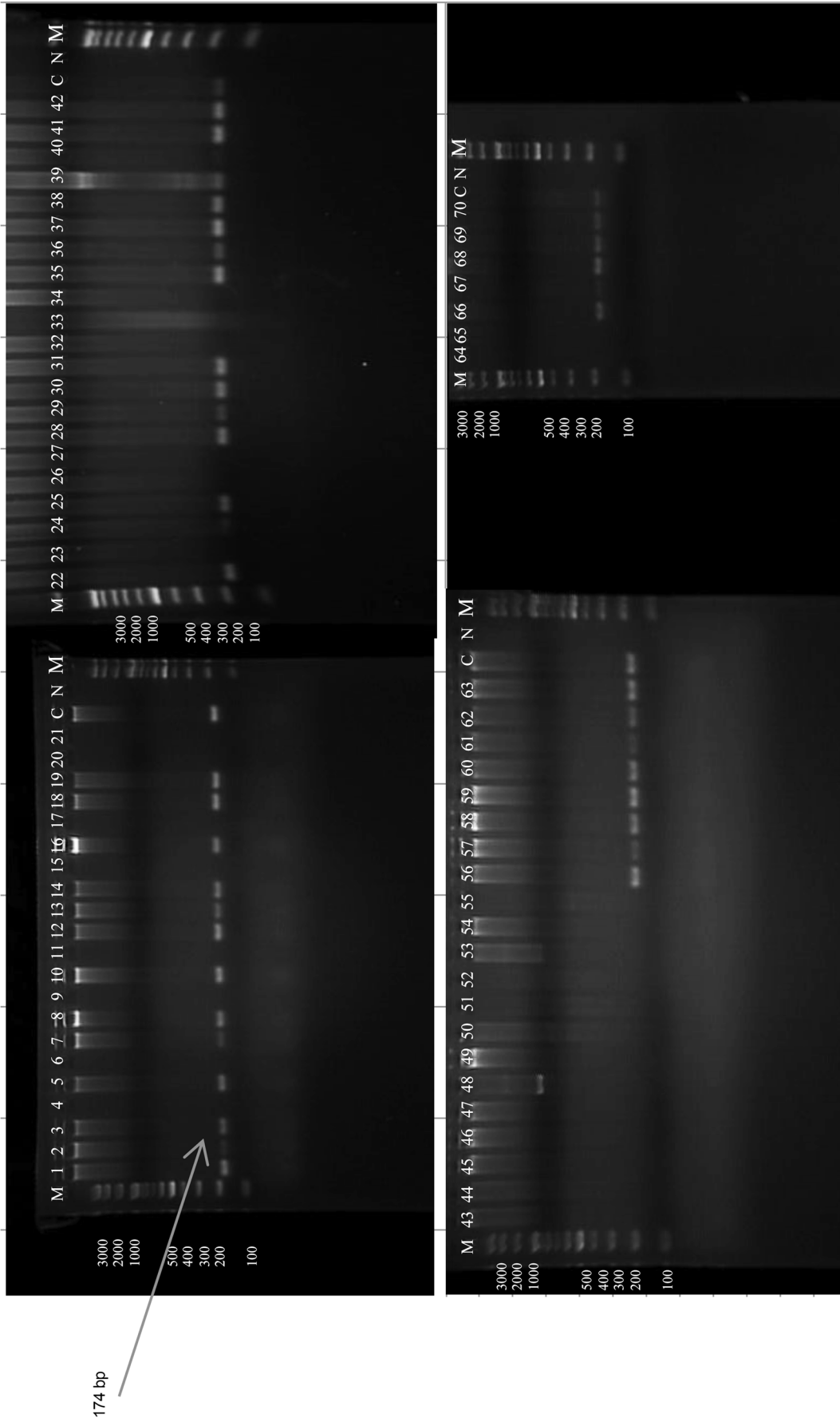
Fig. 2. Detection of E. dispar after using species specific primers in the second round of the nested PCR; amplification products were analyzed by agarose gel electrophoresis and the stained gels were visualized under UV light. Positive samples exhibited 174 bp bands, which appeared in sample numbers (1, 2, 3, 5, 7, 8, 10, 12, 13, 14, 16, 18, 19, 22, 24, 25, 28, 29, 30, 31), (35 to 42), (56 to 63), and (66 to 70). Samples (4, 6, 9, 11, 15, 17, 20, 21, 23, 26, 27, 32, 33, 34, 64, 65) and (43 to 55) tested negative for E. dispar . C represented positive control, N represented negative control and M was the 100 bp DNA marker.