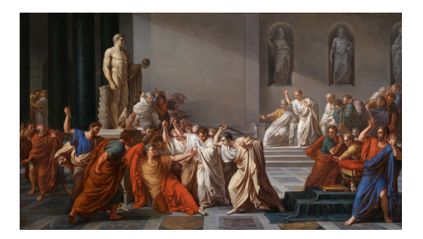
Figure 14.1: La morte di Cesare (V. Camuccini)

For an illustration, let us take a situation like the one in Figure 14.1, the assassination of Julius Cæsar (as depicted in the 1798 painting by Vincenzo Camuccini).