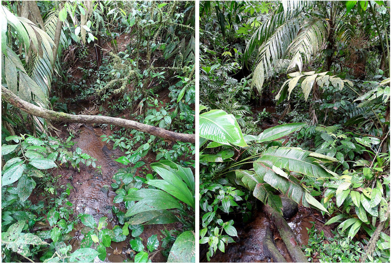
Figure 2. Habitat of Elga leptostyla in the Tirimbina Biological Reserve, Sarapiquí, Heredia, Costa Rica.

Donnelly TW (1992) The Odonata of Central Panama and their position in the neotropical odonate fauna, with a checklist, and descriptions of new species. In: Quintero D, Aiello A (Eds) Insects of Panama and Mesoamerica, Selected Studies . Oxford University Press, Oxford, 52–90.