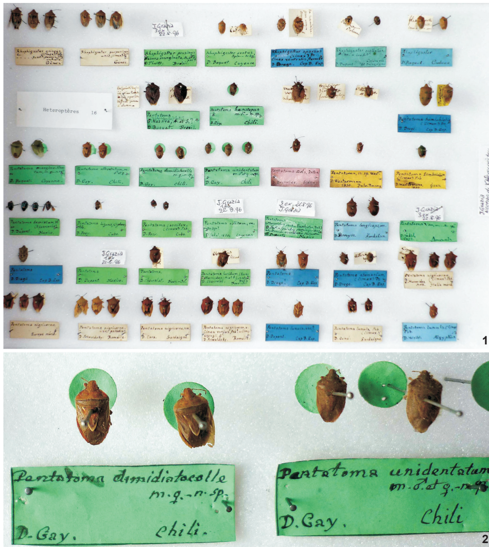
Figures 1-2. Spinola’s collection box, Museo Regionale de Scienze Naturali, Turin. (1) Full box; (2) detail of the same box showing lectotype male and female of Pentatoma dimidiatocolle [sic], lectotype male and female of P. unidentatum , and the respective green labels.

only the first left antennal segment present, both hemelytra and the apex of the scutellum missing. One female in fairly good condition, with a white label on pin “ Chlorocoris complanatus , Dall., ( Pentatoma ) Guérin, Chlor. tau [sic], m. olim [illegible]”.