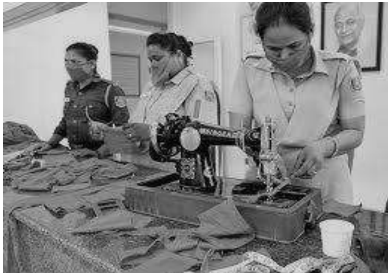
Photo 2:- Three women cops engaged in sewing the mask for poor people.