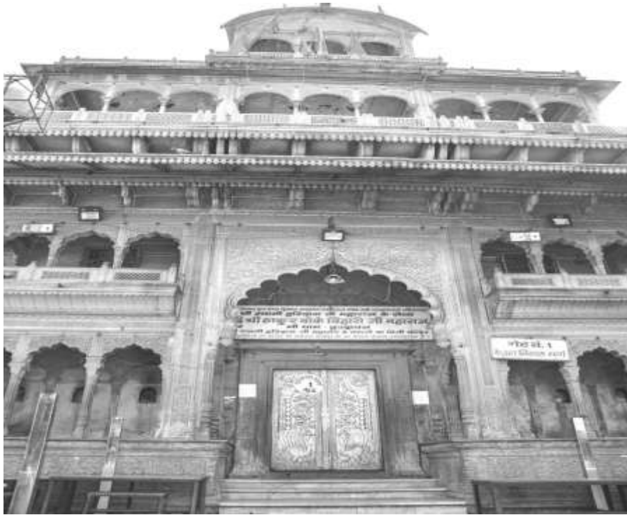
Photo 3:- The Banke Bihari Temple in Mathura closed due to Corona Virus.