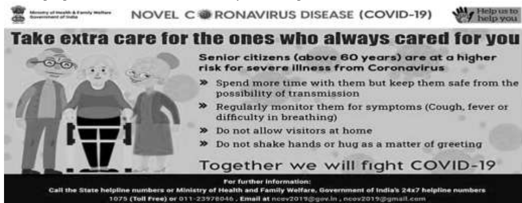
Photo 1:- A Health Ministry poster regarding precautions to be taken by the elderly.