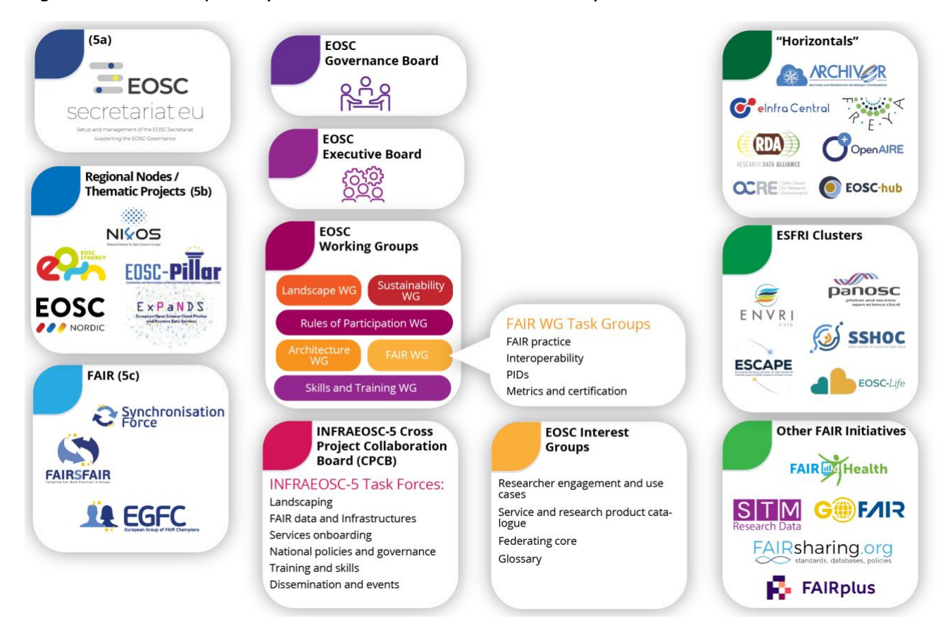
Figure 1. FAIRsFAIR primary stakeholders within the EOSC ecosystem

The stakeholders that were actually represented in the second Synchronisation Force workshop and the workshop participants are listed in Appendix 1 and 2, respectively. For ease of reading of this report we will use the term "projects" to refer to the INFRAEOSC-5a-c and ESFRI cluster projects but also to the EOSC Working Groups and the FAIR Champions.