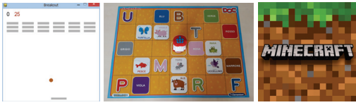
Figure 4: Experimental scenarios: BREAKOUT, SAPIENTINO, MINECRAFT

complex game (variant B ) using the learned DFA as the restraining bolt, using the same approach described in (De Giacomo et al. 2019). Finally, to assess policy learned we simulate its execution together with the original LTL_f/LDL_f DFA checking when we reach its final states.