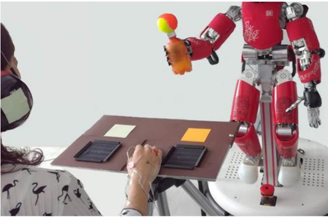
Figure 2. Snapshot of the experimental setup of the interactive task.

ball in its hand, but moved the hand toward it, as in a pointing. Ten participants performed the task in both conditions in two separate sessions. The results reported in Fig. 3 clearly show that the vitality of the robot action modulates the vitality of the participants' motion.