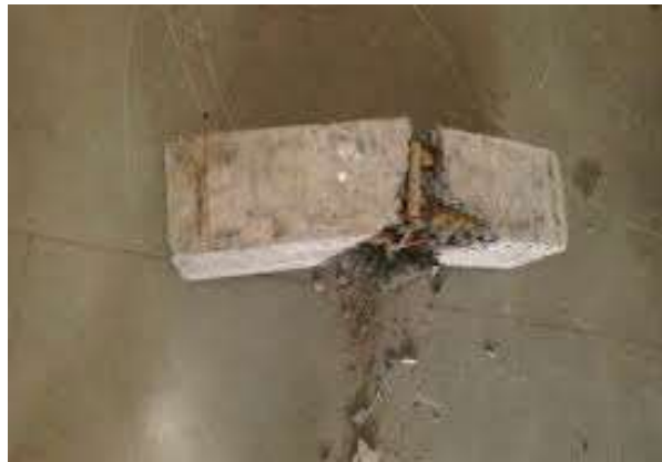
Fig.2: Failure by Compression in Bamboo Reinforced Beam