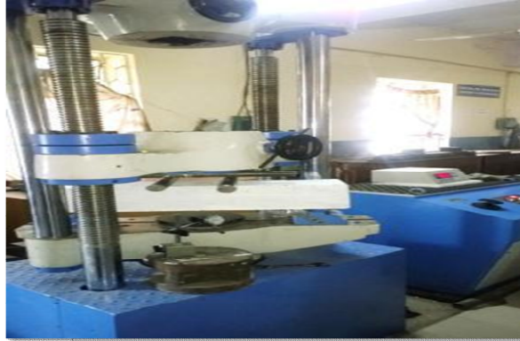
Fig. 2: Universal Testing Machine

Properties of bamboo reinforcement, mix proportion of concrete, design and construction technique with bamboo reinforced concrete will be discussed. The major requirement of bamboo when used in reinforcement is the concern for water absorption which is the main requirement. From various studies the water absorption among different species were found. Among which Dendrocalamus giganteus , known simply as DG and Bambusa vulgaris hard, BVS are the ones which absorbed less water than that of others. The rate of water absorption can also be reduced by certain treatment processes. [9]