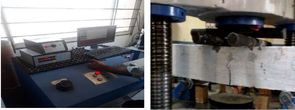
Fig. 1: Testing of bamboo reinforced beam