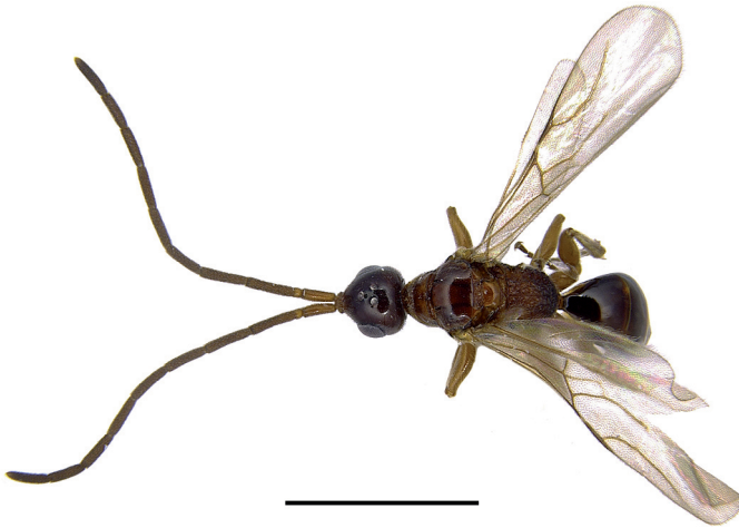
Fig. 1: Male holotype of Embolemus reunionensis n. sp., habitus in dorsal view. Scale bar = 1.4 mm.