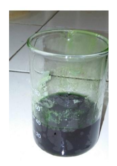
Fig1 .Extract of Andrographis paniculata extract.

The Freshly collected leaves of Andrographis Paniculata Were cleaned and air dried under shade for 48 hours. Then dried leaves were then grounded into powder using an electrical grinder.150 gm of powder was extracted using 250 ml of methanol. The mixture was allowed to stand for 24 hours to ensure that all solvents and samples were completely homogenized. The macerated mixture was then filtered using filter paper and Buchner funnel. The liquid was concentrated and evaporated using a rotary evaporator under controlled temperature of 55^{\circ} c. The resultant extract was then stored in a refrigerator, prior to use.[4]