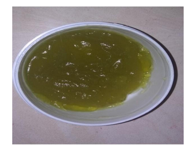
Fig 2. Andrographis paniculata gel of Conc 8% v/v.