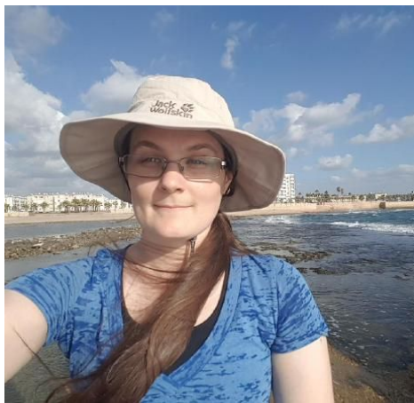
Yo Yehudi ayoyehudi