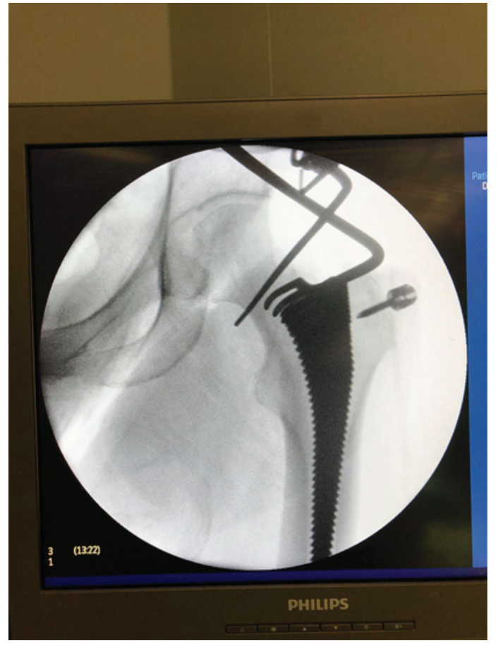
Picture 2: Intraoperative X-Ray of the femoral broach with the screw of the F-Tag in place.

The baseline for leg length and offset was subsequently measured with the navigation system after attaching the F-tag to the single-pin interface. Before neck osteotomy we verified our height with the c-arm, also checking this way the position of the F-Tag (Picture 2). Next, neck osteotomy was performed using the proximal part of the femoral broach as a guide. Acetabular reaming via the small extra stab incision of the SuperPath was performed. Simutaneous check of the inclination and anteversion of the reamer is possible and vital. Given the fact that the acutabular reamer of the SuperPath is hemispherical and the actual component is elliptical, slight (up to 10 degrees) differences from the final component fixation are acceptable.