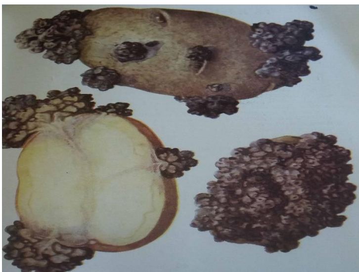
Рисунок 1 Зараженный раком картофель.

Возбудитель болезни плодится в опухолях. Часть их остается при уборке картофеля в почве и заражением ее на долгое время. Это опасная болезнь распространяется частично путем попадающихся среди здоровых клубней опухолей, а частично через проливающих к клубням зараженные почвенные частей. Чрезвычайная приспособляемость гриба и образование новых приспособляющихся к местным условиям биотопов с сильнейшей наступательной способностью в любой время и на любом месте могут поставить под угрозу безопасность возделывания картофеля (5).