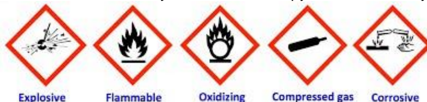
Fig. 1. Globally Harmonized System -Physical Hazards Pictograms

Flammable gas burns if it is mixed with air, oxygen or other oxidants, in the presence of a source of ignition i.e., Hydrogen, LPG, Methane, Ethylene, Ethane, Propylene, and Isobutylene, see figure 1.