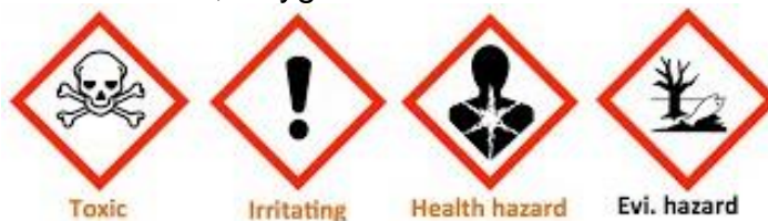
Fig. 2. Globally Harmonized System -Health hazards Pictograms

Oxidizing gas supports combustion i.e., Oxygen and Nitrous oxide.