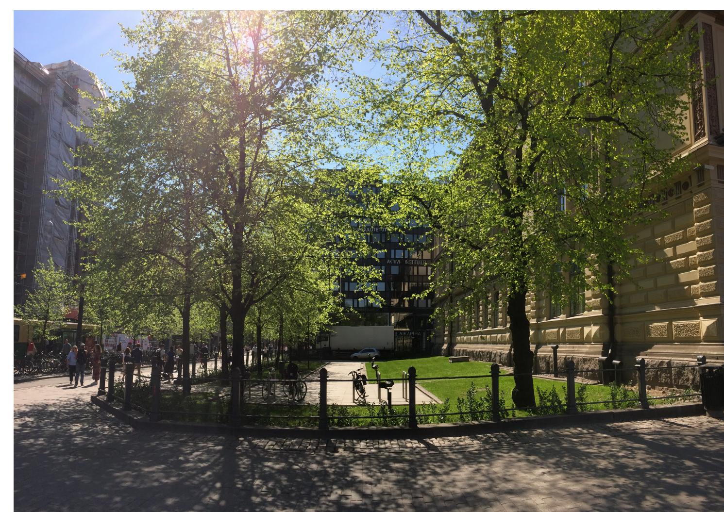
Trees providing shade in Helsinki

UF-NBS are intended to address societal challenges, provide ecosystem services for human wellbeing and biodiversity benefits, and increase urban resilience. UF-NBS services are provided by peri-urban and urban forests, forested parks, small woods in urban areas and trees in public and private spaces.