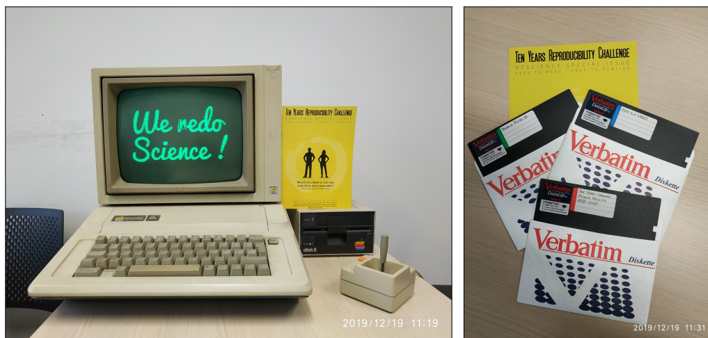
Figure 5. The original LOUPE program running on a vintage Apple IIe with brand new data

to be among the best (and probably one of the most expensive) solution. Second step was to acquire “brand new” floppy disks and again, I was surprised, but this time, by the plethora of vintage floppies you can buy online. I bought a box of 10 floppies dated back to 1992. I then wrote the image to one floppy (three times in a row because the floppy were quite old) and I booted the machine with the floppy. The final result is shown on figure 5.