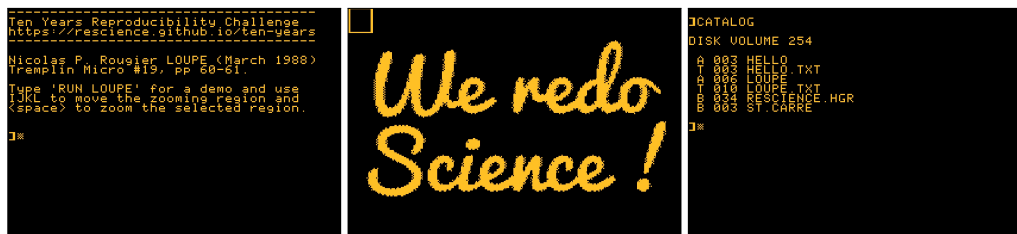
Figure 4. Screenshots of the final floppy image with the LOUPE program. The image can be used with most Apple //e emulators.