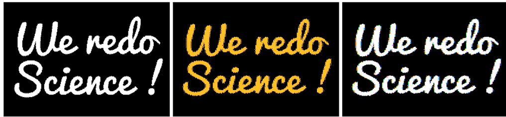
Figure 2. PNG black and white image (left) converted to the HGR format (center: monochrome, right: color) by the tohgr program using Floyd-Steinberg dithering.

care of rescaling and dithering and also produce a PNG image showing the result of the conversion (see figure 2).