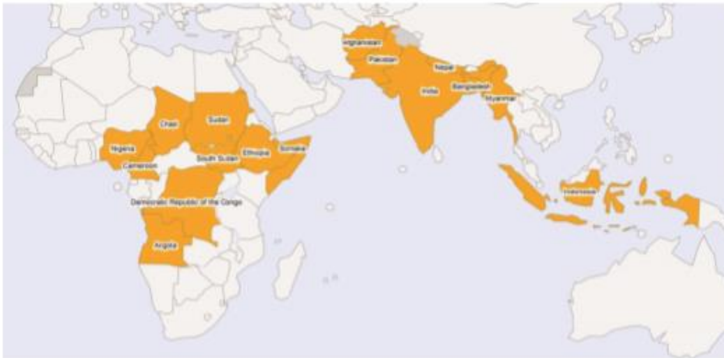
Figure 2. The 16 priority countries for polio transition planning [8].

The polio oversight board was made by the mutual cooperation of the manager general of World Health Organization, the managerial administrator of the United Nations Children's Fund, the leader of Global Development of the Bill and Melinda Gates Foundation, the head of Rotary International and manager of the Centers for Disease Control and Prevention. The purpose of this board is to see the accomplishment of the GPEI funding.