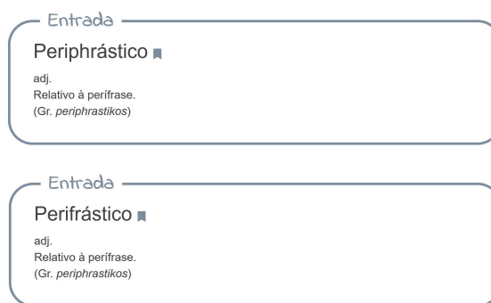
Figure 2: perifrástico [periphrastic] and perifrástico [periphrastic] in DA

For this task, we have ignored the old orthographic variant forms of a given lexical unit, as they are present in duplicate in DA (with an updated version of the form). Since the DLPC is a contemporary dictionary, these orthographic