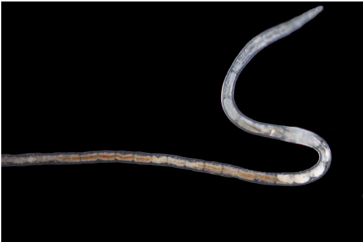
Fig. 1. Specimen of Grania chilensis Prantoni, De Wit & Erséus, 2016.

The checklist is arranged in chronological order and based on a bibliographic survey. All records of Grania from published papers and monographs were reviewed. When available, additional information on habitat, geographical distribution and museum catalogue numbers is included.