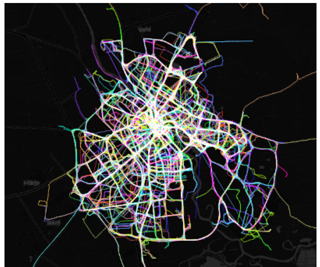
Figure 1: GPS data vizualization (bad) example: Tartu bicycle sharing system, July 2019

In: A. Kmoch, E. Uemaa, D. Nüst (eds.): Proceedings of the 5th AGILE PhD School 2019, Tartu, Estonia, November 2019, published at https://doi.org/10.5281/zenodo.3835767 .