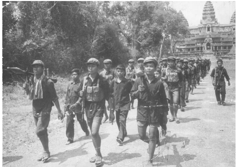
Khmer Rouge troops march on Angkor Wat

The second major obstacle to the popularization of the Special Protection system was the politicization of the nomination and inscription process in the 1970s, which took shape around the site of Angkor Wat. In 1972, war broke out in the Cambodian province of Siem Reap, and the Khmer Republic attempted to place centers containing monuments at Angkor and Roluos, the monuments of Phnom Bok and Phnom Kron, and a refuge for movable cultural property at the Angkor Conservancy headquarters under Special Protection. 14 Angkor Wat, as a site of outstanding universal value not located near any military objectives, should have fulfilled all criteria for Special Protection. 15 However, Cuba, Egypt, Romania and Yugoslavia objected to the Khmer Republic's request on the grounds that they considered the then-government not to be the legitimate representative of the Khmer Republic. The Khmer Republic chose not to pursue the lengthy and costly arbitration procedure that would follow. The Director-General of UNESCO was further blocked from provisionally inscribing the cultural property, as this was only permissible for applications made during times of peace, and the request had been made in the midst of war. 16 This political power play consigned the Special Protection system to irrelevance and obscurity. No further inscriptions were made until 2015, when Mexico succeeded in placing nine cultural heritage sites under Special Protection.