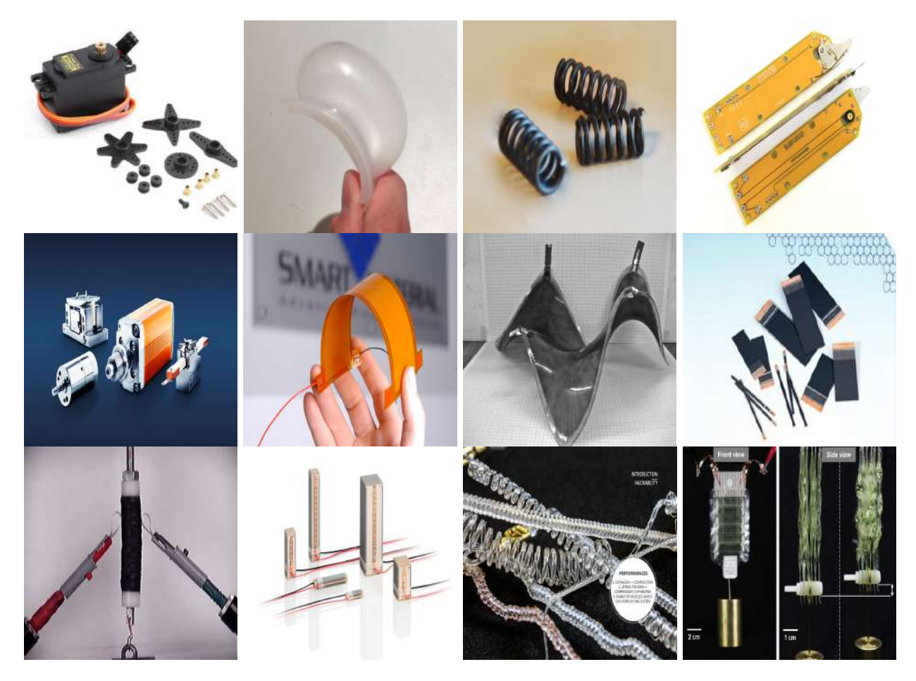
Fig. 1. From left to right and up to down: 1) Commercial available traditional servo motor; 2) Pneumatic actuator out of "Ecoflex"; 3) SMA springs; 4) SMA linear actuator; 5) Commercial piezo motors; 6) MFC out of NASA; 7) PEA actuated sheet; 8) Commercial EAP plates; 9) Stacked PEA concept; 10) Commercial stacked PEA for low displacement, 11) Different configurations of TCP; 12) Peano-HASEL actuator.

and also it has a high risk for people if they are near the place where the system is operating. These systems have their use restricted to grasping in open fields.