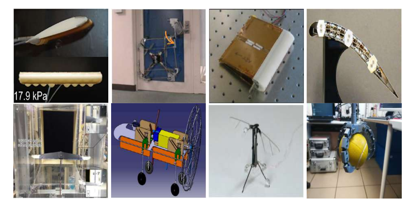
Fig. 2. From left to right and up to down: 1) Pneumatic actuation of a wing profile using actuators out of "Ecoflex"; 2) UAV performing vertical perching on a door and opening it using pneumatic actuators; 3) Wing profile with MFC used for morphing; 4) Wing profile with SMA springs for morphing; 5) Fixed wing UAV with SMA linear actuators for the winglets; 6) Conceptual design of a deployable landing gear on an UAV using SMA; 7) RoboBee micro UAV actuated by PEA; 8) Grasping end-effector of an ornithopter, actuated by TCP.

among the different options during the design phase of a new research.