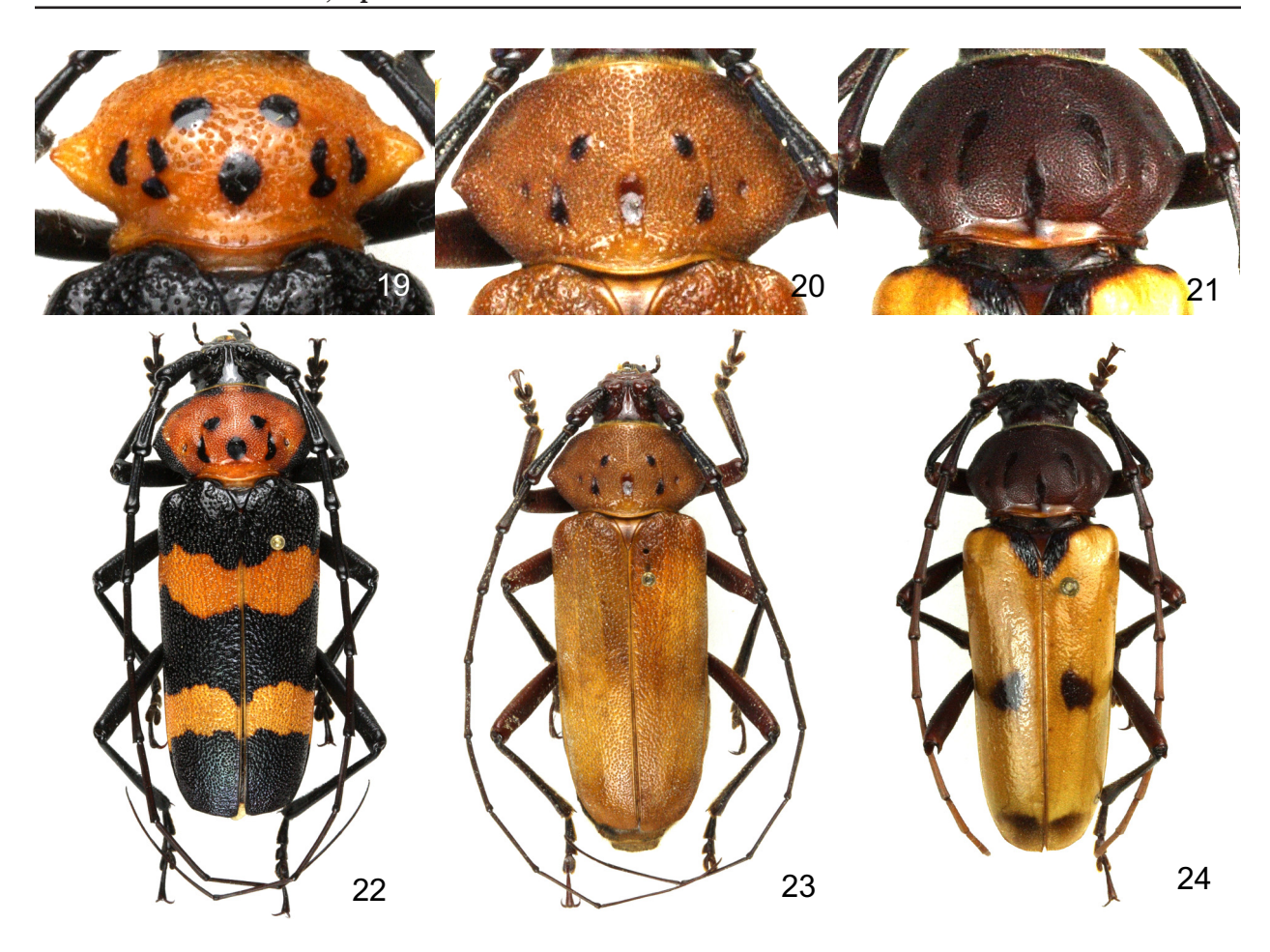
Figures 19–24. Figures for use with amended key above. 19) Crioprosopus nieti , female, La Perla de San Martin, Veracruz, MX, with lateral tubercles on sides of pronotal disc obtuse. 20) C. wappesi , male, Baja Verapaz, Guatemala, with lateral tubercles on sides of pronotal disc obtuse. 21) C. servillei , male (i.e., C. divisus ), La Paz, Honduras, with sides of pronotal disc broadly angulate; with pronotum inflated. 22) C. nieti , male, 14–15 km W Sontecomapan, Veracruz, MX with transverse orange band on elytra, leg and antennae black. 23) C. wappesi without transverse band on elytra, head, antennae and leg reddish brown. 24) C. servillei , elytra flavo-testaceous, finely punctate, and disc with dark spots on anterior margin adjacent to scutellum, transverse maculae in middle, and irregular macula apically.