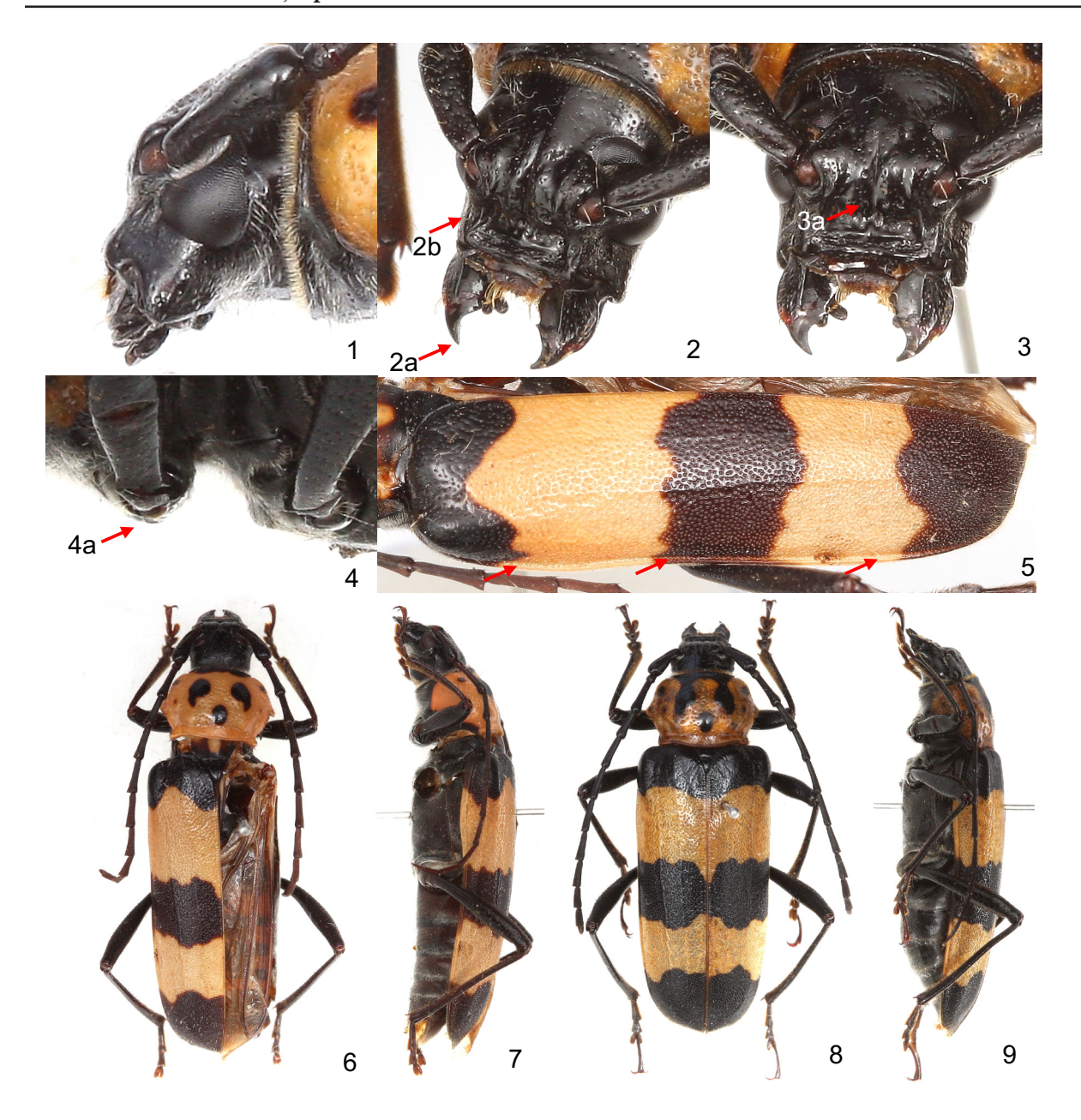
Figures 1–9. Characteristics of the head of Crioprosopus , and dorsal and lateral view of Crioprosopus baldwini , sp. nov. 1–3) C. baldwini , paratype, Boquete, Panama showing characters of the head of Crioprosopus as described by Linsley (1962), i.e., "front large, perpendicular, abruptly separated from anteocular space." 1) Gena large, quadrate well separated from lower eye lobe. 2: 2a) Apex of mandibles acute, simple; 2b) Dorsal anterior margin of genae ridged. 3: 3a) Front perpendicular to vertex and recessed or indented between the "anteocular space" (i.e., between the dorsal anterior margin of gena) so the front is "pushed back in towards the eye." 4: 4a) Prosternum with intercoxal process arcuate at apex. 5) Elytra distinctly marginated laterally. 6–7) Dorsal and lateral view of C. baldwini , holotype, female, Puntarenas, Costa Rica. 8–9) Dorsal and lateral view of C. baldwini , paratype, female, Boquete, Chiriquí Prov., Panama.