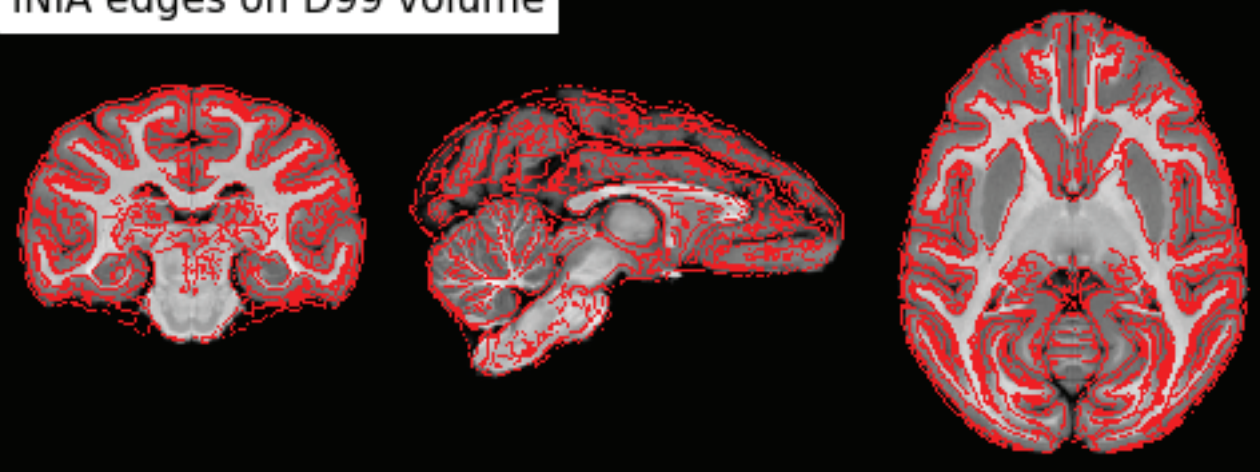
INIA edges on D99 volume