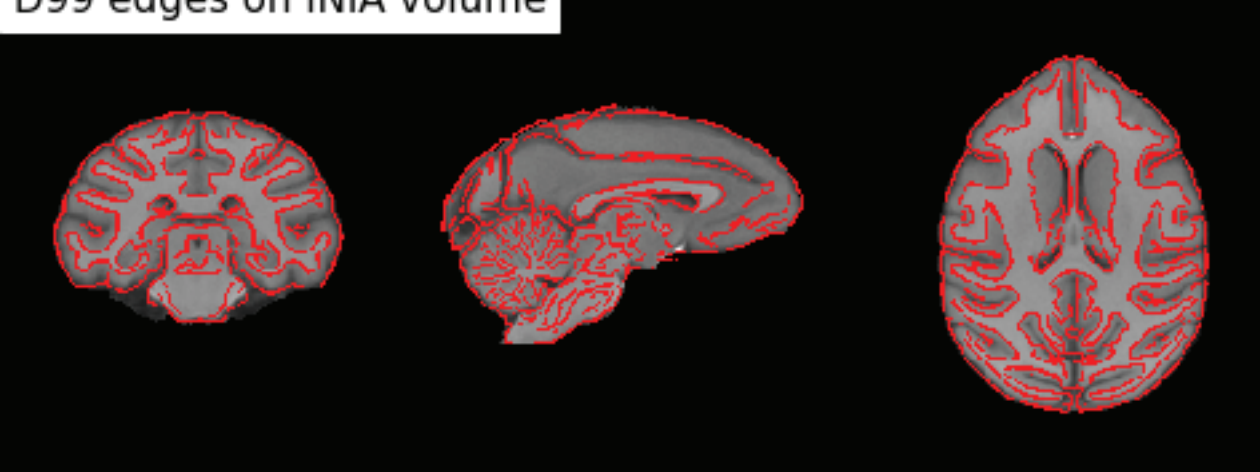
D99 edges on INIA volume