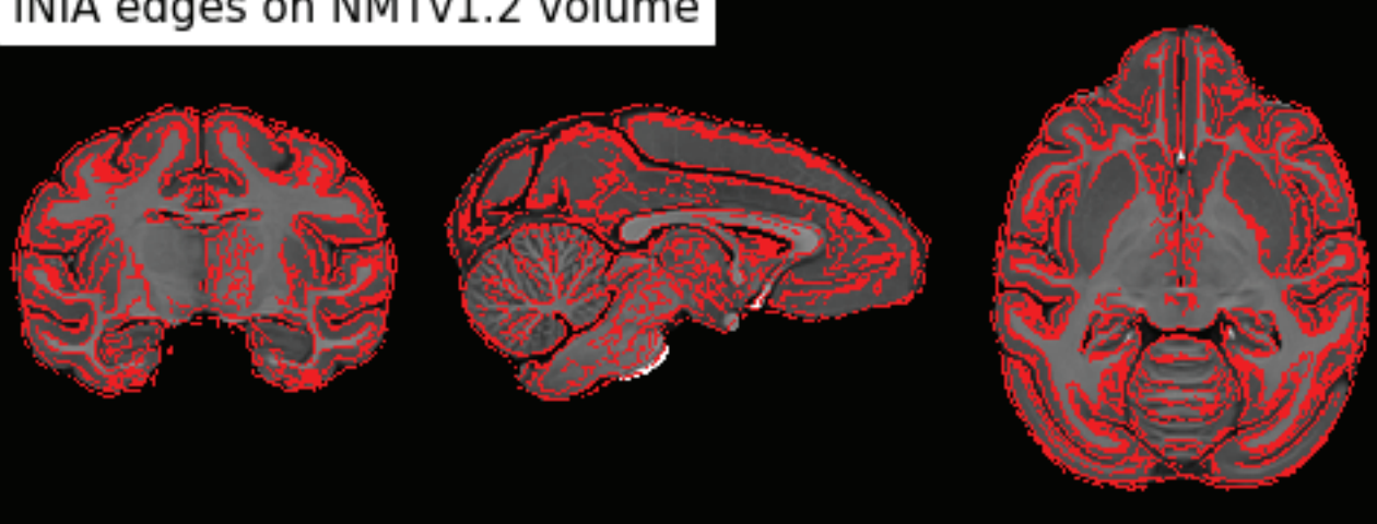
INIA edges on NMTv1.2 volume