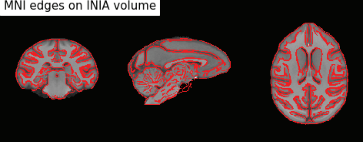
MNI edges on INIA volume