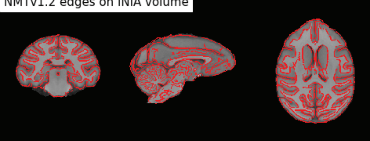
NMTv1.2 edges on INIA volume