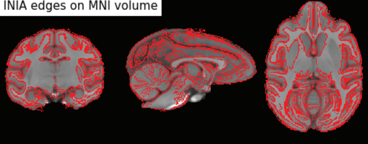
INIA edges on MNI volume