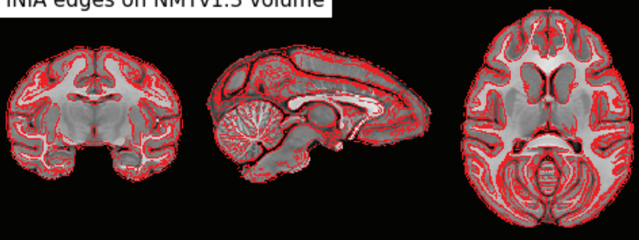
INIA edges on NMTv1.3 volume