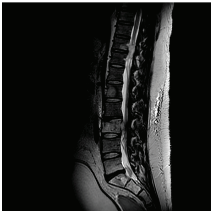
Figure 1: Thoracic and Lumbar MRI shows multiple metastatic lesions and epidural tumors causing cord compression.

the T11 vertebral level until resistance was felt. The further attempt to advance the catheter resulted in a loop formation at L1. (Figure 2) Then a 5 mm vertical incision was made at skin from the Touhy entry site inferiorly, and a second Touhy was advanced subcutaneously from 8 cm inferior-lateral to the midline incision site. When the second Touhy needle tip was visualized, the midline Touhy was slowly removed under the fluoroscopy guidance while maintaining the catheter tip location at T11. Then the catheter end was passed through the second Touhy needle tip in a retrograde manner followed by removal of the second Touhy needle. The skin was closed with 4.0 Prolene, and the catheter was secured using Tegaderm and tapes.